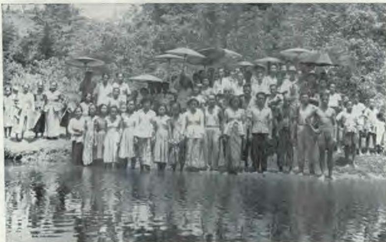
Baptismal service—Tondig, Marudu, North Borneo