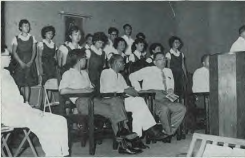
The thirteen students who received diplomas for having completed the "Light of the World" Voice of Prophecy Correspondence Course.