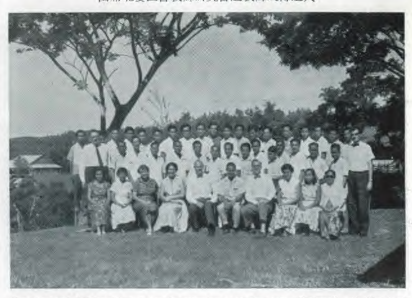
Teachers and Ministerial workers in attendance at the 1959 "Retreat" and Teachers institute held at Tamparuli, North Borneo.