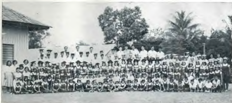
The Sunnyhill school in Kuching, Sarawak, had 150 graduates from the recent Vacation Bible School.

following year, and at present are continuing their studies at the SAUC. The first girl student joined the church the third year, and a record number of six pupils stepped into the watery grave with the Lord this year. One of these six expressed a desire to work for Jesus in the saving of precious souls for His kingdom, and publicly stated his ambition on one of the school speech days. He informed his audience that of all the different subjects he was studying in the classroom, he liked the Bible lessons best. This is indeed the most welcoming reward for all the time and energy spent on these children.