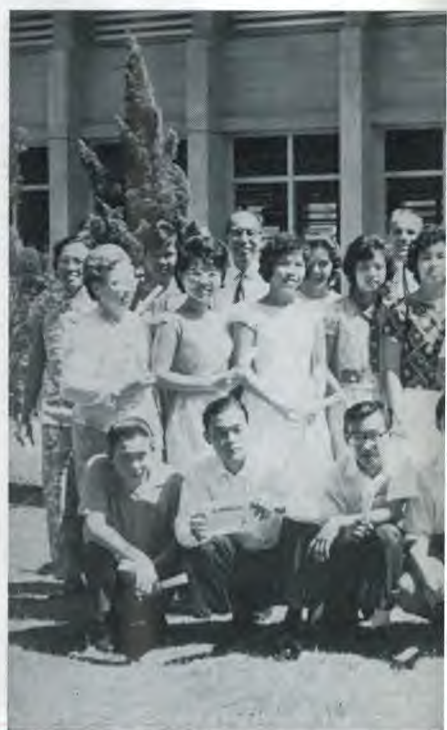
A group of those who graduated from t

In June of 1964 my wife and I were baptized into the remnant church. Through the power of God and prayer I turned my back on