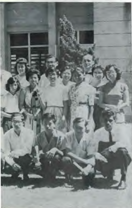
Prophetic Guidance Course in Penang.

In 1962, our Mission began its first Voice of Prophecy broadcast in the Thai language and I was chosen to be the speaker for this broadcast. This was a new and very interesting experience for me, and even though our program was cut off the air, it seems that now we have a good chance to get back on the air again soon. I am now broadcasting a weekly health broadcast on the local station in Chiang-mai. I thank the Lord for the Voice of Prophecy.