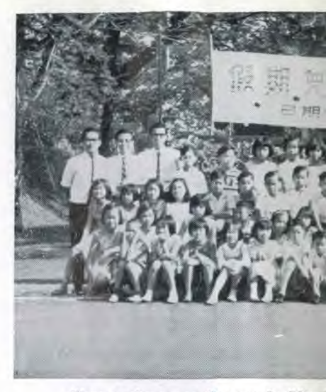
Shown above are the nearly fifty Bible School lea

their meetings with hardly any non-S.D.A's present. Now at the close of these efforts they have a goodly number which will henceforth require their time and effort in visiting and giving Bible studies to. A number of these pastors are already mapping out their plans to hold one or more such small efforts before the year is over. Truly we can look forward to a good harvest of souls this year to offer to God for His manifold blessings to us.