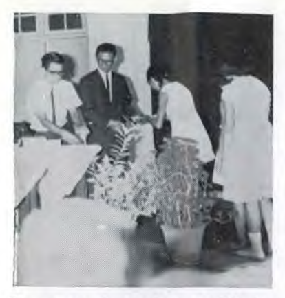
Young people receiving certificates at closing exercises of Kuala Lumpur Vacation Bible School.