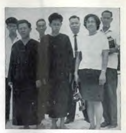
Baptism at Kuantan.

Several months ago this young man found his way to the gate leading to the house where our pastor