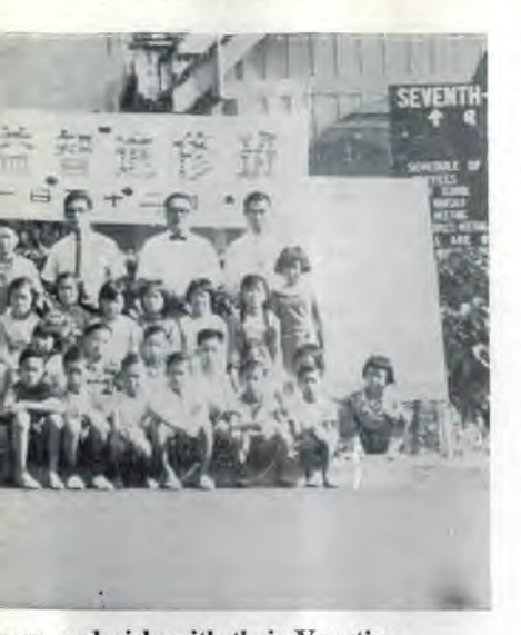
ooys and girls with their Vacation Kuala Lumpur.

petent help. He himself undertook to teach one Bible class and the handwork class.