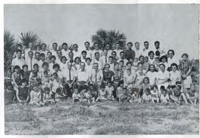
70 Thailand boys and girls enjoyed Vacation Bible School.

This retreat is not all study and work. In addition to the classes and discussion periods, there are organ-