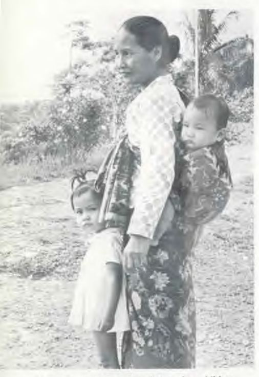
Here an earnest mother brings her children to their meeting place. The Sabah mission is moving forward in child evangelism.