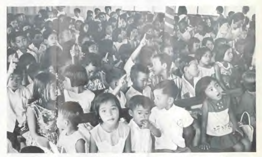
The children thronged to each of their programs. Singing, stories, and many other interesting things were well-prepared for them.

Mission workers prepared a large pavilion for our believers to enjoy. Here we see the adults at one of their meetings.