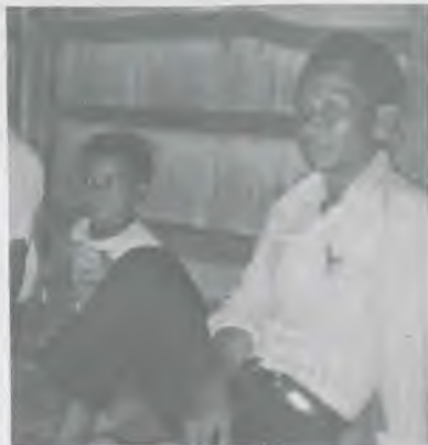
Courageous house owner

The Beluran Effort was certainly most encouraging and inspiring. This is a new area for 1979. There has never been a pastor, a member or a branch Sabbath School in this district. Then God opened a way for his work. One man took pity on us and said that he and his wife would like us to hold meetings at his house. We were thrilled to accept the invitation. During the first meeting, we had to tear down the partition of one of his rooms because there wasn't enough room. I was very reluctant but he was willing to let us remove the partition. Then the next night more people came and once again there wasn't enough room for them. So he asked me to take out the wall separating the kitchen and we extended the front porch as well. Now that we had more space, more people came. In fact about 85% of the people in that village came including the Evangelical Mission pastor and his family, and some government officials. I think the devil was not very happy because so many people came to our meetings. He worked hard to stir up the people. Some grouped themselves together to disturb, but the owner said, "I am the owner of this house. I have been here every meeting and I do not have anything against these Adventist teachings. In fact I have never heard any teaching that is as clear and good as the teachings of the Seventh-day Adventists. If you people are really planning to disturb these meetings, watch out! I am not afraid to face you all." We were really touched by this brother's decision.