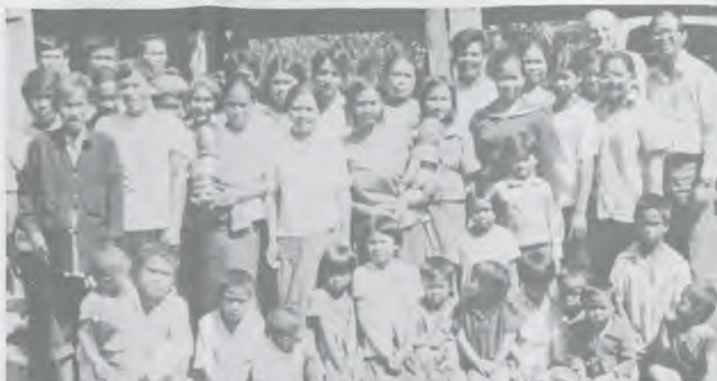
BAH Outreach Clinic to Ubon villages