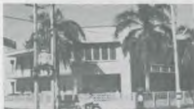
Front view of HaadYai Mission Hospital