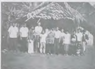
Lahuu Tribe Branch Sabbath School

blankets for use in carrying her during that 45 minute walk back to the car. But within 15 minutes the baby made his appearance! and once again God had shown His power in our extremity when we are unable to do what needed to be done.