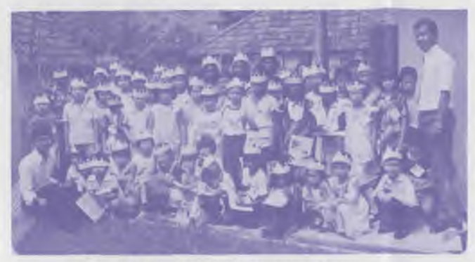
Fifty-six precious jewels for Jesus from Queenstown

Fifty-six children from the Queenstown neighborhood in Singapore attended the graduation program which climaxed the seven-day Vacation Bible School during the June holidays. Out of these fifty-six boys and girls of different racial backgrounds, thirty-two graduated with certificates showing that they have attended at least four of the seven morning meetings. The meetings were conducted in the five-year old bungalow-house church in the high-rise community of Queenstown.