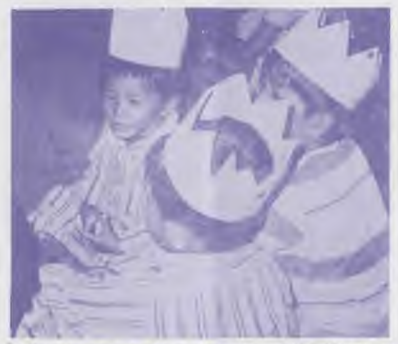
"I'm here even though I got up late!" says a little boy from Kopistan.

The leaders prepared materials for about sixty children and it was a disappointment to them when only twelve children came on the first day. However, they were not disheartened. They believed the best advertisement for the VBS would be these twelve enthusiastic children who were encouraged to invite their friends. The "twelve little disciples" did not fail them. On the second day,