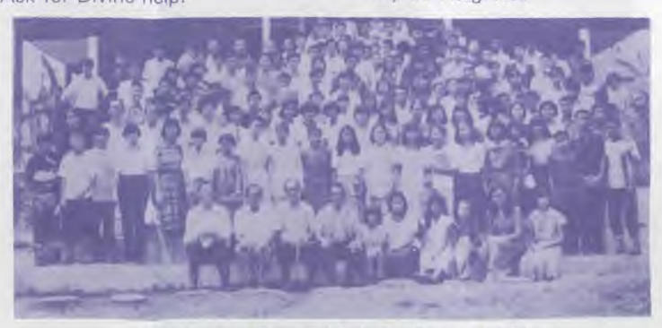
270 delegates who attended the first Festival of Faith.