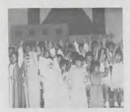
Ipoh Adventist Kindergarten's multi-racial students

Established in 1974, Adventist Kindergarten in Ipoh, Perak continues to grow from an initial enrollment of 18 students to the present 120 students.