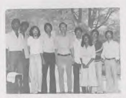
We are thinking and praying for you at Spicer Memorial College!

My next stop was Poona. While at Poona I visited Spicer Memorial College which has a large and beautiful campus with a number of industries where many students are gainfully employed. We also have six boys and one girl studying at SMC. I