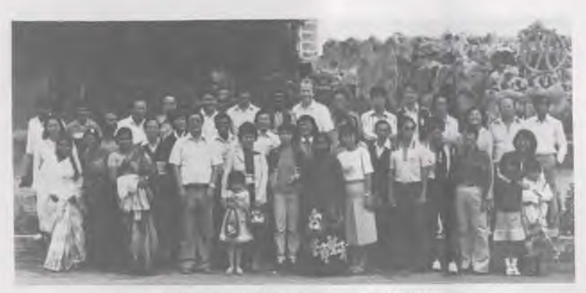
"United we stand to finish the work in WMSMI"