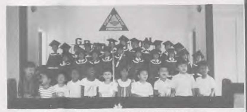
Our little light-bearing graduates of Pontain Adventist Kindergarten.