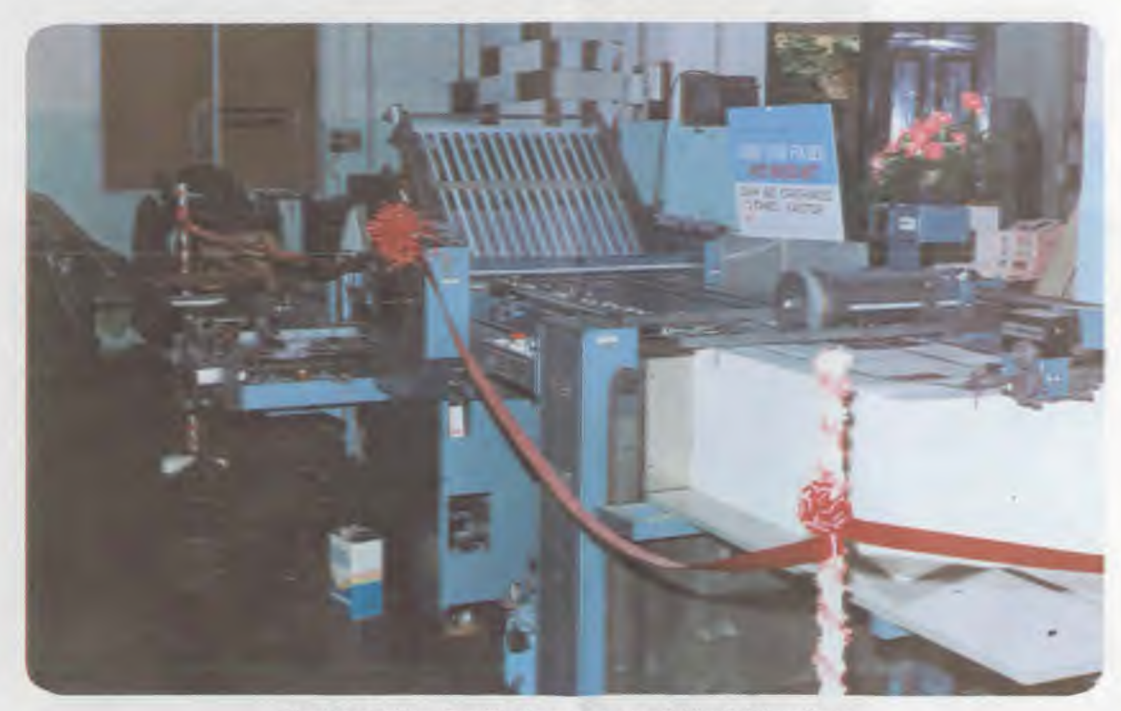
Shoei Star Folder: Capable of turning out our folding 3-4 times faster.

Our front cover and colored photos on pages 8—10 this issue have been produced through the courtesy of the Southeast Asia Publishing House.