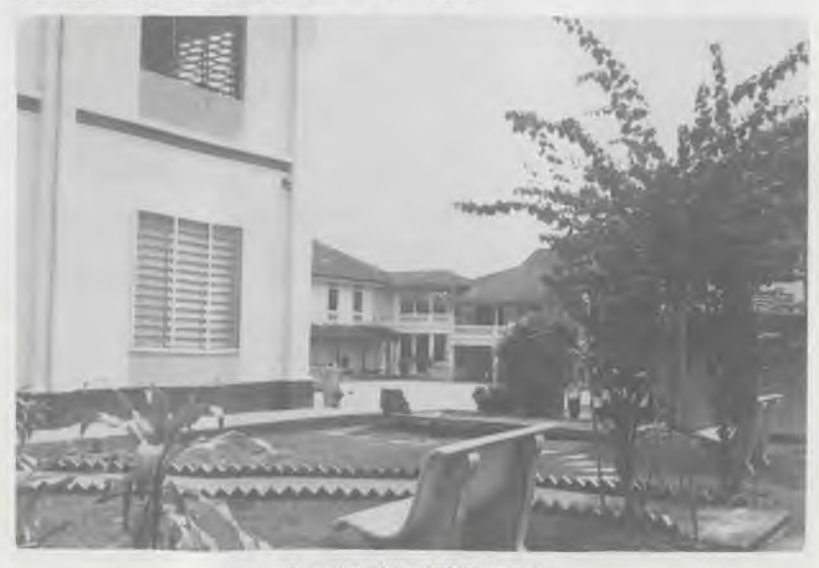
A section of the SAUC compus

for applications and further information.