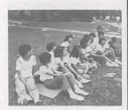
These young Pathfinders from SDA School are so engrossed in the story!