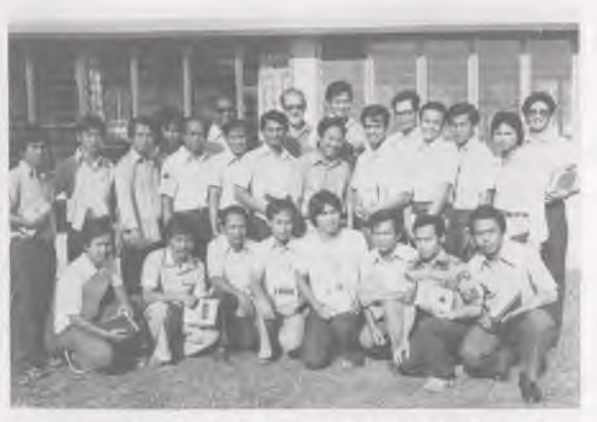
Our pastors in Sabah are on the go! Every year, local extension classes are held for them where they are able to earn credits through the Continuing Education Units [CEU] way.

Sabah Mission is placing great emphasis on Christian education. There are thirteen church schools and two secondary schools in Sabah which are operating under financial strain. They appeal to you for your generous offering in helping the young people in Sabah get a Christian education.