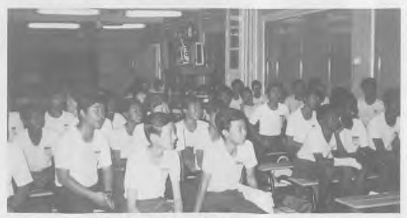
Apprentices of PSA Technical Training School during Anti-smoking Campaign.