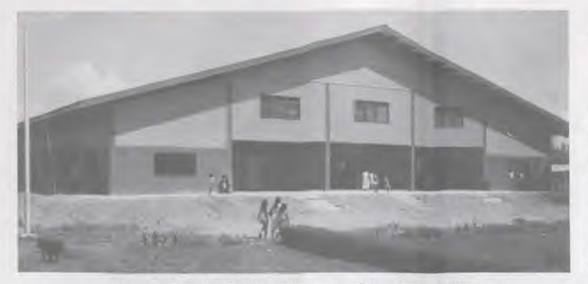
New Goshen Auditorium with a seating capacity of 3000.