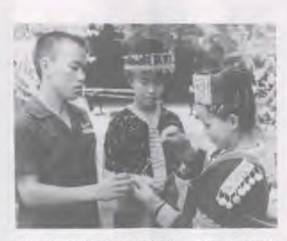
Whose Pulling The Strings? : Hmong youth learn knot tying.

northern mountains, the camp provided a unique opportunity for these voung Hmong Adventist men an women to become acquainted and enjoy fellowship together. In keeping with this aim of camp a debate was held on Friday night. The question debated was, "Should Adventist youth choose their mate from among Adventist youth?" Both teams as well as the audience narticipated enthusiastically and good points were raised by both sides. But all agreed that ultimately a marriage will be happy only when both partners love Christ, so even if one does court a non-Adventist it is desirable to lead him or her to Christ before marriage.