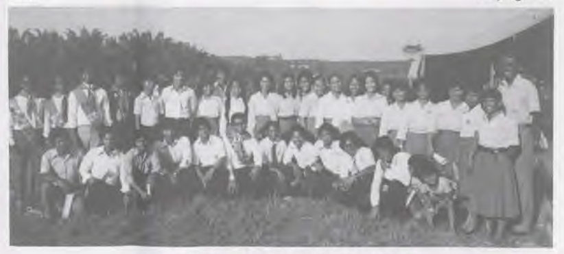
A group dedicated to finishing the work in Sabah.