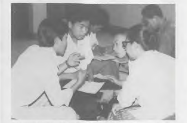
Strategy Session: Chiang Mai Church delegates plan evangelism.