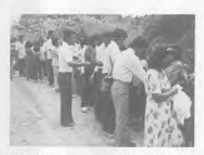
The highlight of the Youth Congress was the baptism of eighteen souls.