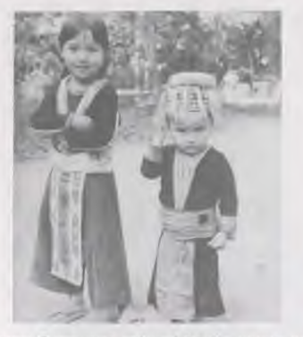
Hmong Camp was enjoyed by the young and the very young.

Ever since the first Hmong youth camp was held last year the Hmong youth had been asking when we would hold the next camp. They were not disappointed when the Second Hmong Adventist Youth Camp was held April 27-May 2 at a christian camp at scenic Mt. Doi Suthep National Park which overlooks the city of Chiang Mai. Nearly 60 Hmong youth came from four provinces in northern Thailand to spend five days together in the cool, pine-scented mountain air.