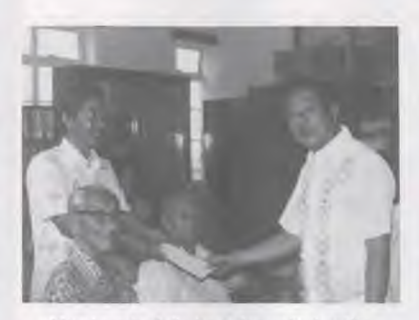
Members joyfully leave for united action.

The young people make friendly visits and deliver new lessons each week to some 100 active students. They have been doing a thorough