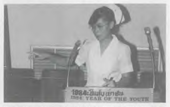
A student nurse from Bangkok Adventist Hospital is speaking on the "Sower and the Seed" as a part of VOY training.