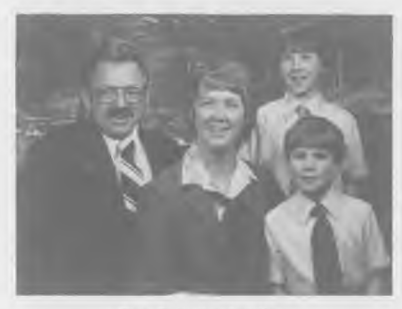
The Spindler family.