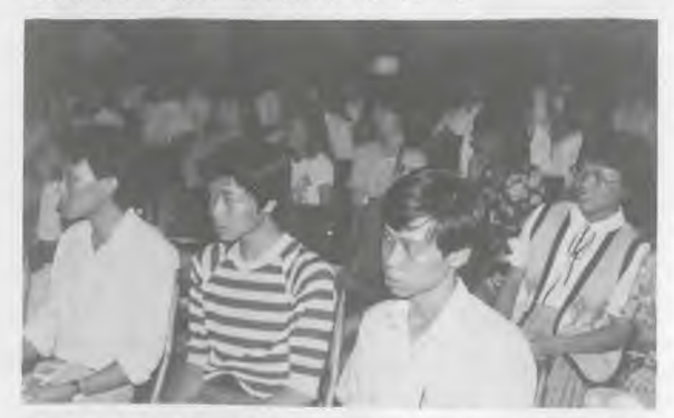
Part of the young people who participated in the opening night of the Voice of Youth Training Seminar at Bangkok Chinese Church