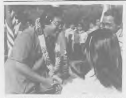
Datuk Clarence Mansul, Sabah's Minister of Industries came to open the Pathfinder Fair at Tamparuli, Sabah.