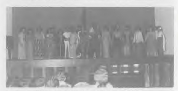
"College artists bowing at the grand finale."