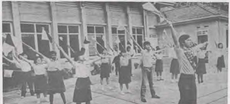
Rev Siew training club members on flag-signalling