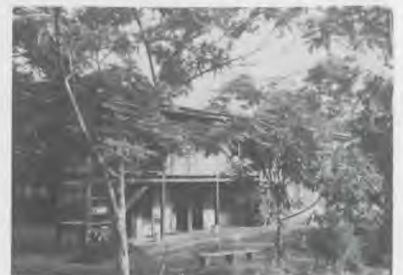
Old Boys' dormitory crowded far beyond capacity.

Over each weekend the faculty and a large number of students visit the villages in the area. Branch Sabbath schools are being conducted, worship services assisted, Bible studies given, and souls are being won. What a joy it is to see this institution being such a tremendous blessing to the work throughout the Thailand Mission. W. L. Wilcox