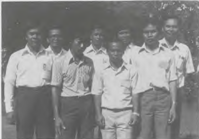
The Sabah delegation