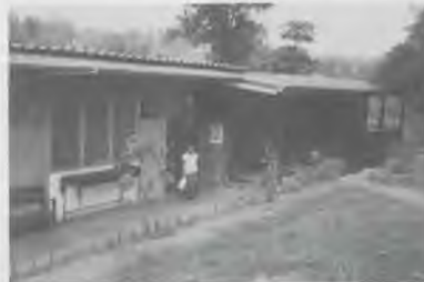
Kaw Po, Rangoon trained nurse, stands in front of the Thailand Educational Center clinic, operated by the Bangkok Adventist Hospital.

Every young person is expected to work from 3 to 4 hours each day. Mornings, from 8:00 - 12:00, the tribal and senior academy students will be found working in the gardens, on the farm, or at other duties around the campus. In the afternoon the junior academy youth work a 3-hour shift. The faculty are working with the students as well as having another 6 full-time work supervisors. Just this year another 2½ acres of farm land were added to the total school acreage, and if funds are available, another 3 acres will shortly