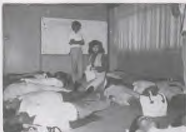
200 relax during Stress Control Program.

Bangkok is filled with people under stress. The program was conducted to meet that felt need. Massage techniques were introduced to assist in muscle relaxation