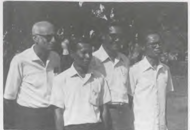
The four from Thailand.