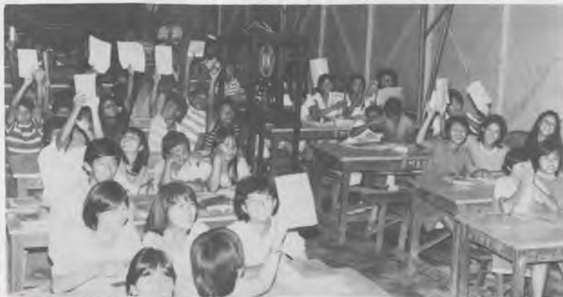
A group of smiling students with new Bible in their hands.

people in the past to the Adventist church through his Pathfinder activities in Kuching and in his own school. The more than 250 who attended the meetings nightly are the interests brought by the members of his Pathfinder Club at Penrissen Secondary School. The