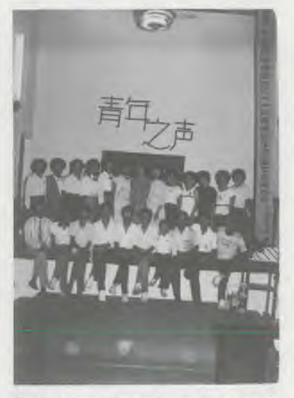
The VOY team. The vertical scroll on John 3: 16 unrolled during the alter call is on the right.

The way the Lord blessed these dedicated young people was absolutely astounding! The atmosphere of the closing night was most captivating. The Holy Spirit manifested Himself strongly. As the call was being made and the appeal song "Heavenly Gift" sung, the audience were stricken with conviction. As they beheld John 3: 16 unscrolled from a gift box and slowly lifted heavenward, they sat in awe, and then stood to their feet. Marching down the aisle, they accepted Jesus for the very first time. Five came, then ten, twenty, and finally thirty. It was unbelievable! It was totally unexpected. Members of the choir were so touched by the overwhelming response that some began crying. Those were tears of joy, tears of gratitude to God for prayers answered, tears of praise for souls saved. Since weeping and singing can not co-exist, their sing-