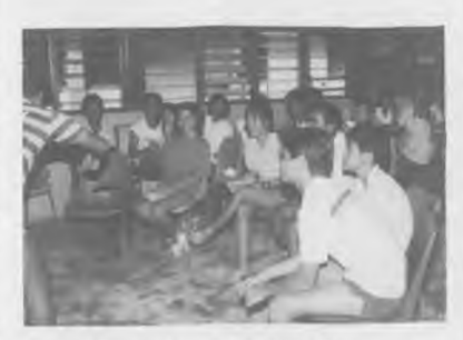
Fun and games at Bible Camp.