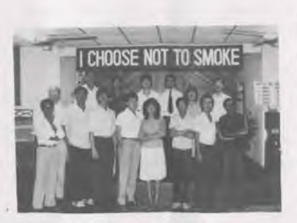
5-Day Plan group members.