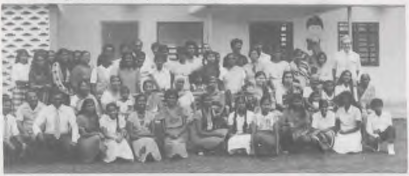
VOP Rally at Ipoh.

God greatly blessed these meetings because of the total involvement of all the people mentioned above. Kindly pray for the follow-up meetings and for the further growth of the Ipoh Indian work.