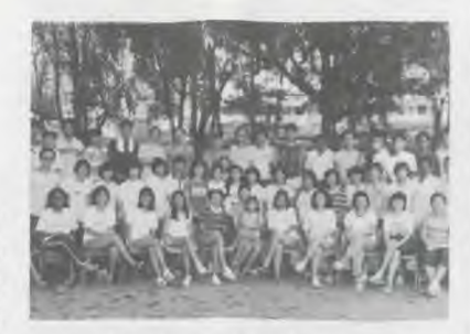
Togetherness spells happiness!!

The successful Bible camp may be the ideal evangelistic effort to draw busy youth in Singapore and other cities to the 'Good News'. — Quek Boon Chuan, Church Pastor, Youngberg Hospital SDA Church.