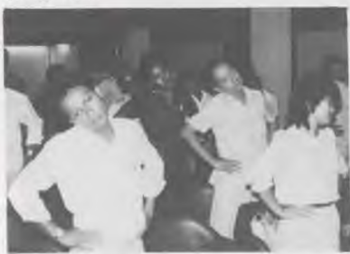
Some of the thirty-five total participants who attended the 5-Day Plan June 24 to 28, 1984 during an exercise session. All participants kicked the habit.

On June 8 & 15 a health lecture was given to King's College as a result, 40 students and faculty members came and learned all our health education programs.