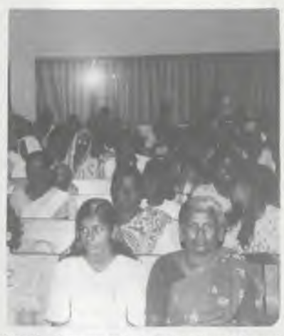
Attentive listeners at Ipoh Indian Church Crusade,