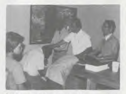
Ordaining two elders and two deacons of the Kam Glang Church on June 12, 1982.