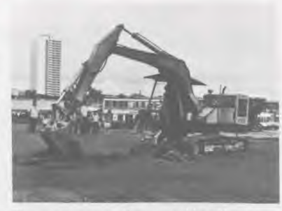
The excavator at the ground-breaking ceremony.