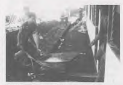
Pouring the cement floor, one wheelbarrow load at a time.