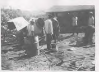
The cement mixer always seemed to be a focal point of activity. In the background is the Educational Centre Church.