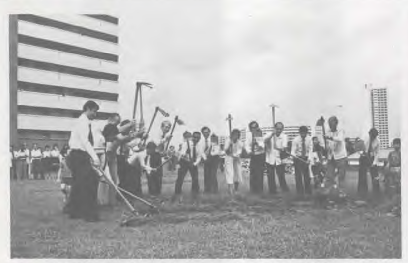
Representatives from the various institutions in Singapore participating in the ground-breaking ceremony.