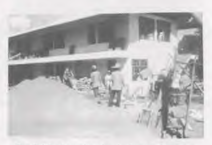
The finished product beginning to shape up.