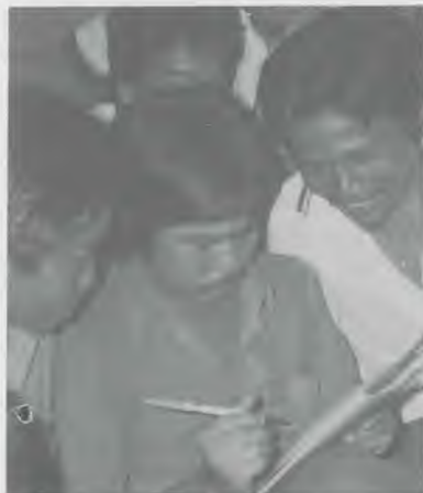
Eager students at Sungei Manila - BA Seminar.