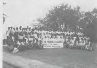
Spirit Prophecy seminar attendants at Port Dickson, Malaysia.