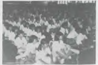
Photo shows some of the Secondary One students participating in Anti-Inhalant Abuse Campaign.