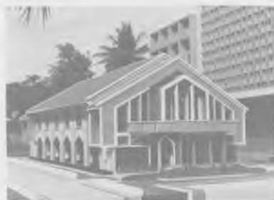
Artistic proposal for Ekamai's future Seventh-day Adventist Church