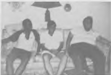
Participants in their relaxing moods.