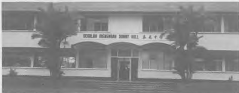
Sunny Hill School.

The teachers keep abreast of modern educational trends through various in-training programs conducted in Malaysia and Singapore.