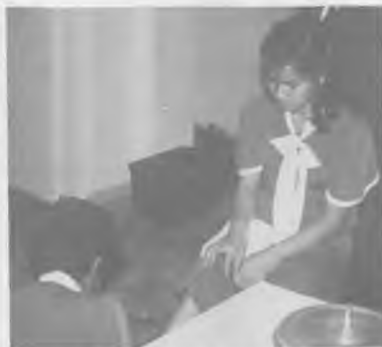
Special moments in footwashing.