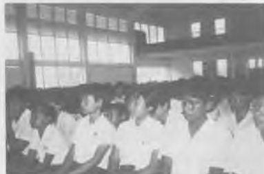
Assembly in Sunny Hill Auditorium listening to a spiritual lesson.