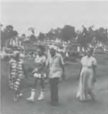
Walking is the best form of exercise.