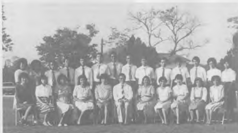
The staff of 1985 comprising the Kindergarten, Primary, and Secondary.