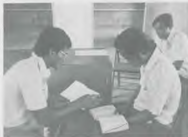
Members practise teaching Bible Speaks at Telopid.