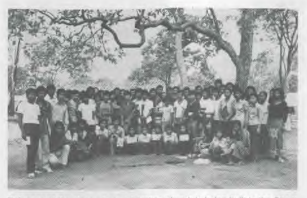
Refugees at the place where a bamboo church is being built in the Site II camp.

The membership of the Nong Samet Khmer SDA Church was about 200 at the time of the evacuation. But as the apostolic church in Jerusalem scattered under persecution so likewise these dear people separated. Some went to Khao I Dang camp, some to Bang Phu Evacuation site, and some to Dangrek Site II. In each new area the members began teaching and spreading the good news of the gospel.