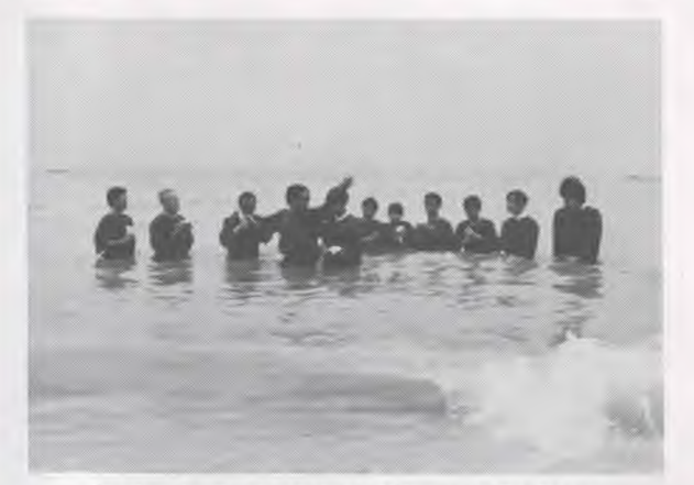
Seashore baptism for students of Singapore SDA School.