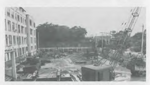
Construction of bore pile being done.

- Merritt Crawford, Construction Consultant, BAH