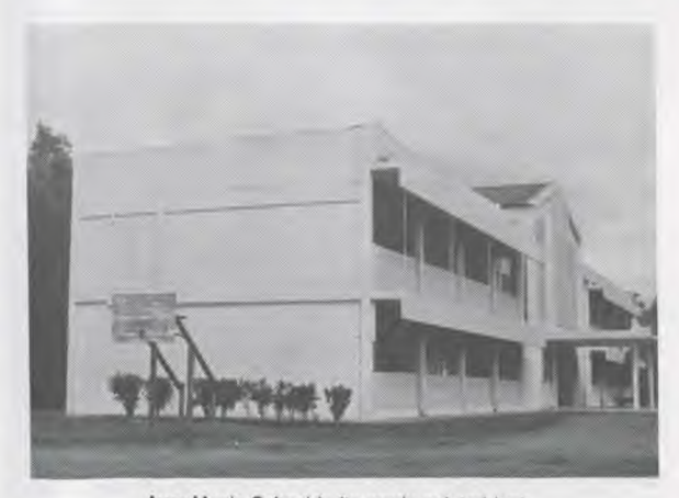
Ayer Manis School in its newly painted look.