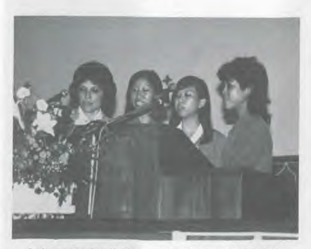
A wide variety of music brought sweet richness to the meetings.