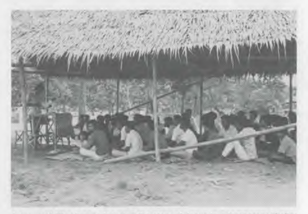
A group of 58 refugees learning the story of Jesus in a temporary shelter of wood and thatch at the Site II (Ampil) camp.

"As the incursion happened unexpectedly, everybody hurriedly left home mostly bare handed. We hated to leave our lovely church. We cried on seeing the black smoke billowed, the camps partly caught on fire, just minutes after the run.... Now we must meet under the trees. All the Christians here still have strong belief in God and expect Him will come soon and put an end to such suffering.... Would you please pray that God will continue to be with us and give us courage. We thank God for saving our lives."