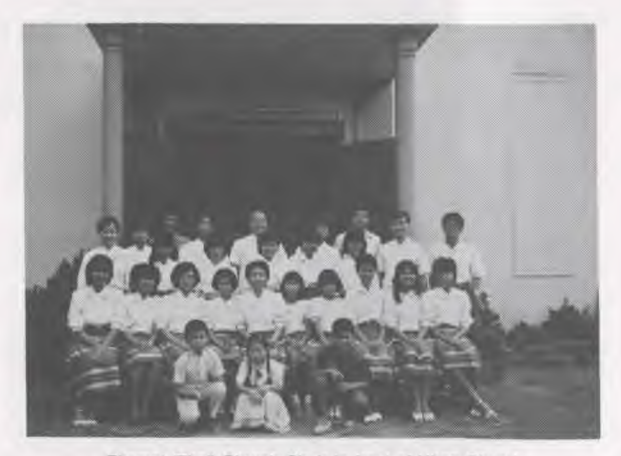
Ekamai (Thai) Church Choir in front of Ubon Church