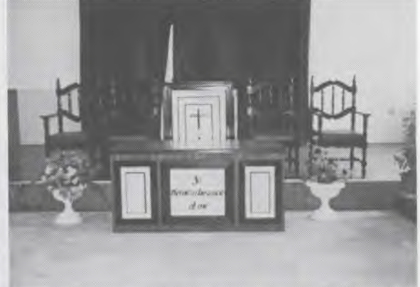
Beautiful new chairs, table, and pulpit dedicated November 16, 1985 at Miri SDA Church in Sarawak.