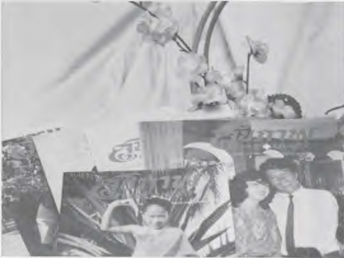
The first six printed issues of Health and Family on display