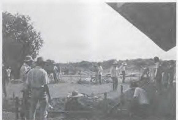
Pastor Dan Walter squatting in the forefront inspecting the laying of the foundation of the new church with the church elder and a native builder looking on.