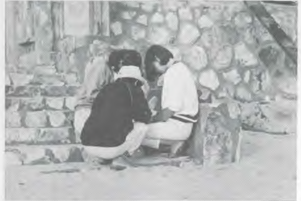
Young people praying by twos or threes became a regular scene around the camp.