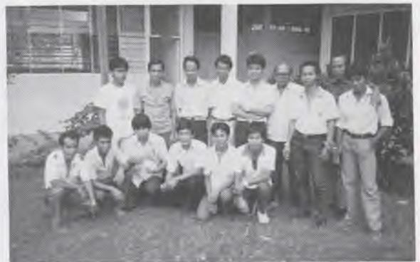
Village Lay Pastors of Sarawak.