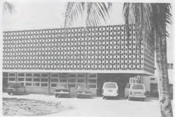
Thailand Publishing House

Carefully he had compared the underlying factors in the evangelistic spread of the Seventh-day Adventist church with the Buddhist religion of Thailand. One thing undergirded their progressive thrust; publications! It