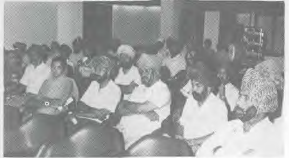
Sikhs Community Health Program conducted by Health Education Department of BAH.