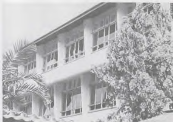
A beautiful school, but in much need of repair