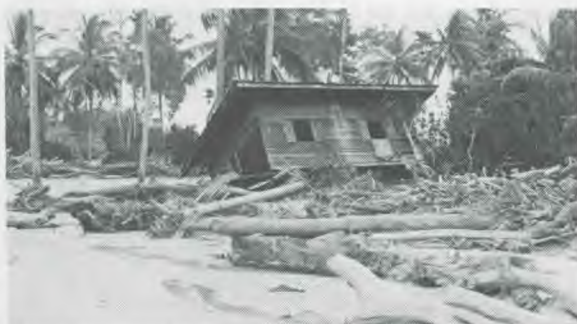
Many homes were destroyed when flood waters washed logs down from the mountains.