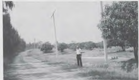
Elder Wilcox standing near some of the electric poles that have already been put in place along the edge of the college property.

The Lord answered our prayers in a marvelous way for