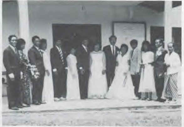
The beaming couples after their marriage.

This program was conducted by the Lay Activities ministry in the local church. The primary goal is to win the non-SDA members from SDA homes to Christ. Secondly, by having such programs, the members hope to instill in the youth the importance of loving and understanding homes. By doing this, the church also hopes to enhance the happiness of each SDA couple in the church.