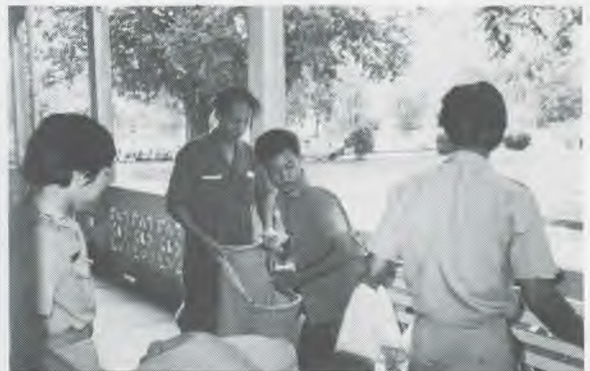
Packing foodstuffs for flood victims in South Thailand.