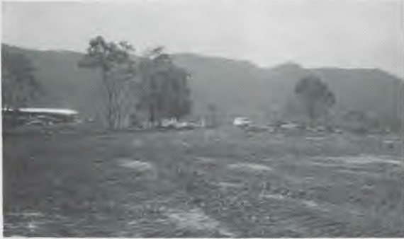
Site of Health Conditioning Center at Muak Lek.