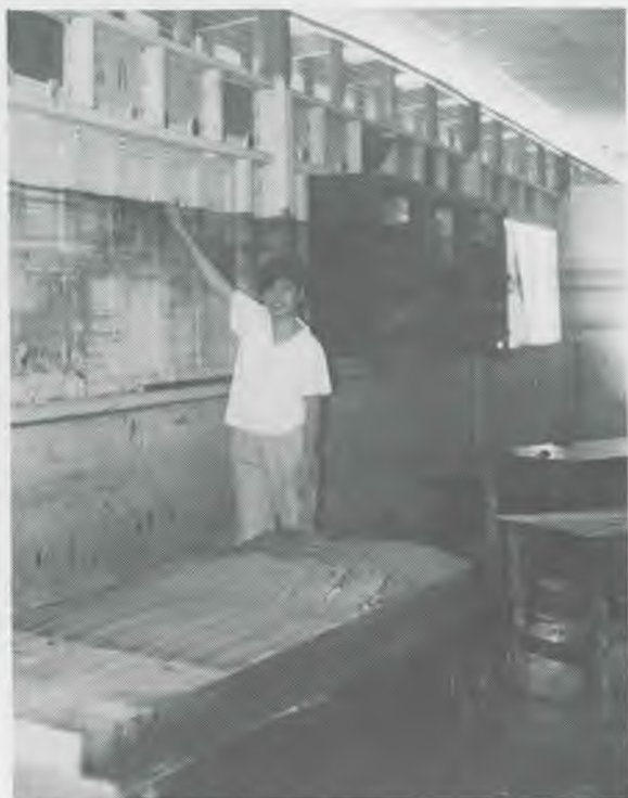
The level of flood at the church school.