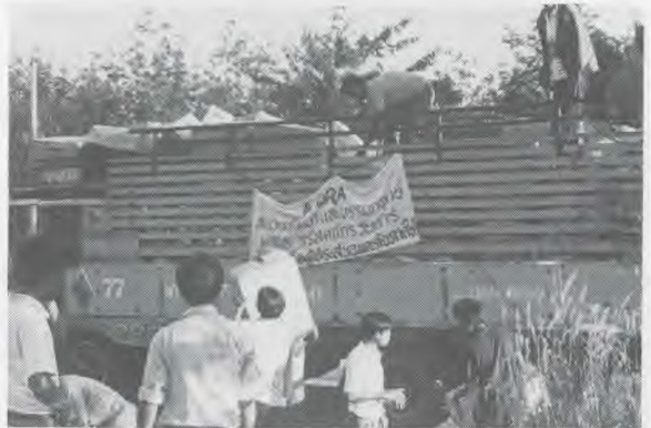
ADRA truck giving emergency aid — food and clothing.

Five thousand flood victims in Southern Thailand have recently received much needed aid from ADRA. Already three trips to the flood stricken areas of the country have been completed. One million three hundred thousand baht worth of supplies and food have been distributed to those who lost their homes and possessions during the storms that hit Thailand in December of 1988.