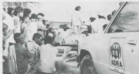
ADRA Thailand distributing food, clothing and other emergency supplies in South Thailand to flood victims.

An older couple in the Haadyai area lost their home due to the flood. ADRA was able to supply 35,000 baht to rebuild their home. How happy and grateful this couple were to have a home again. Many thousands of other homes were destroyed as well. Government agencies and private organisations are trying to get sufficient funds together to build these homes.