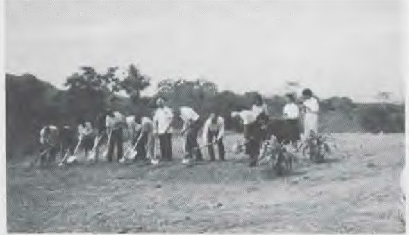
Ground breaking for Health Conditioning Center.

One will hardly recognize the Muak Lek property where the Mission College, as well as the Bangkok Adventist Hospital Health Conditioning Center is being built. Big cement electric poles are now in place along the road leading to the Health Conditioning site and Mission College campus. Soon there will be electric power available where these two new facilities are being erected. Already many building materials have been unloaded for the Health Conditioning Center, located on the same property only a short distance from the Mission College campus.