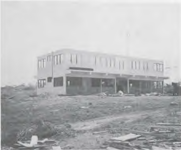
Unfinished fourplex for faculty housing.