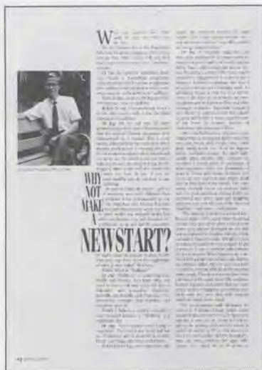
The interview feature that appeared in Wine and Dine .