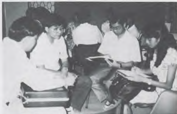
Thomson Chinese Church group planning session for Bold Sequence Evangelism in the local church.

After understanding the philosophy of Sequence Evangelism, many church group participants sat down to formulate goals and action plans for church growth for their local churches.