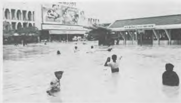
Flood waters downtown Haadyai.