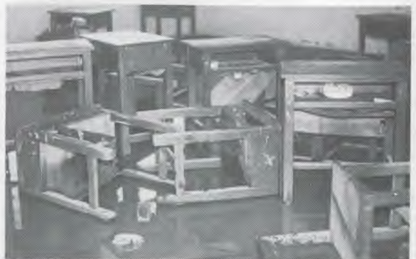
Students' desks were damaged.

The Haadyai Adventist School was flooded badly, resulting in much damage. One hundred thousand baht was raised by the Thailand Mission and churches to help repair our school. Since then the enrollment has increased.