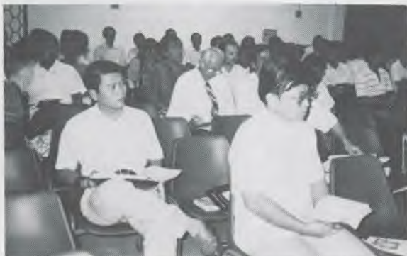
Part of the 84 participants ... listening attentively to the lectures of the Sequence Evangelism Seminar.

Eighty-four lay leaders and pastors from the eight Singapore churches attended the "Sequence Evangelism Seminar," on January 27 & 28, at San Yu High School Audio-visual Room.