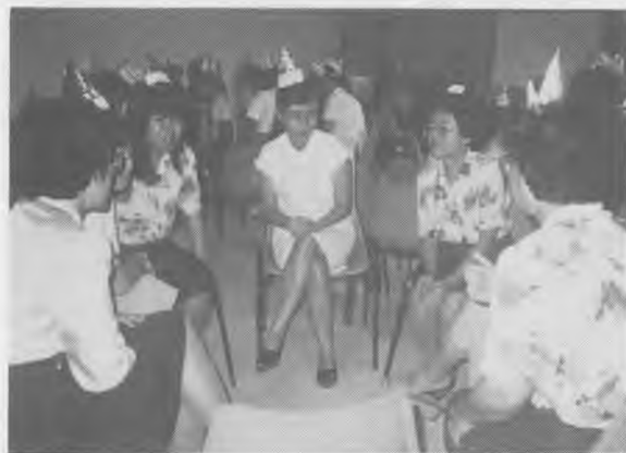
Workshop participants doing an exercise on communication.

Youngberg Adventist Hospital's administration kicked off the new year with a two day workshop on effective communication as the first in a series of in-service education for nurses and hospital staff. A total of 70 staff participated in the workshop held at the hospital conference room from January 18 & 19, 1989.