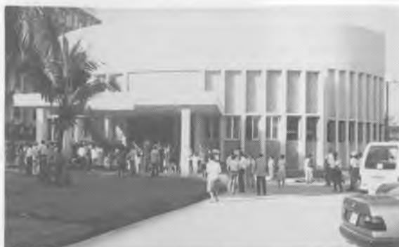
Exterior view of the new Ekamai Adventist Church.

This new church has a beautiful half circular auditorium with balcony that seats about 450 people. A baptistry underneath the rear of the platform is visible from every seat in the church because of the inclined floor of the auditorium. When not in use, the baptistry is covered by