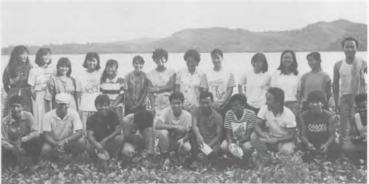
The Junior Youth Instructors and Directors.

The first Junior Pathfinder Camporee held February 3—7, 1989 at Pantai Permai Digot, Kelawat, Kota Belud was an immediate success judging from the response given by the junior campers and their directors alike. While their friends celebrated Chinese New Year at home, 230 junior pathfinders from all over the state spent four days getting to know God through various activities.