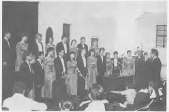
The ProMusical group giving a concert at Balestier Road Church.