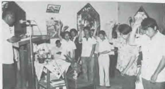
Those who made their vows for baptism.