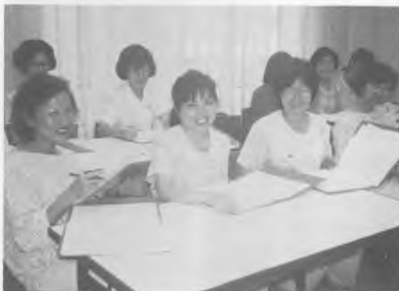
Participants of Intensive Respiratory Care Training.