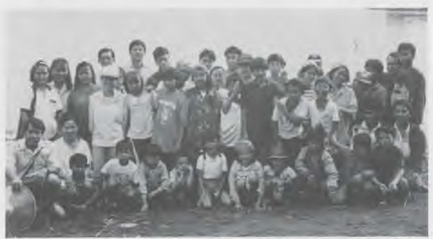
AY camp conducted on an island near Batang Ai Hydro Dam.

The objective of the camp was to address the Adventist youth on the proper concept of courtship and marriage. Topics such as "Choosing Life Partners," "How to Differentiate Between Love and Infatuation," "Proper Ethics of Courtship," "Dangers of Premarital Sex," and "Sexually Related Diseases," were discussed.