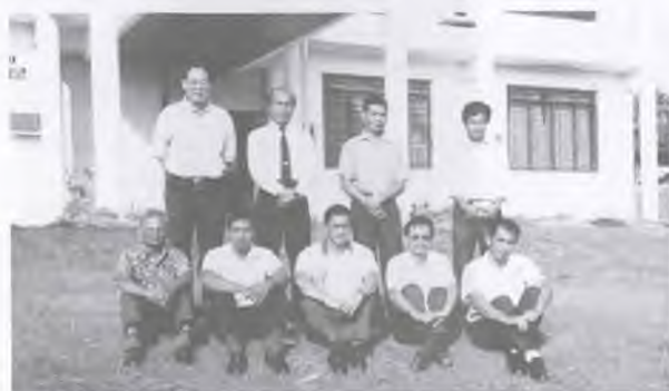
Stewardship Leadership Training Workshop in Sabah

The Mission stewardship director will arrange and coordinate the district stewardship workshops for the members. These workshops will be assisted by those trained stewardship leaders. They will also be expected to conduct the workshops themselves in the local churches.