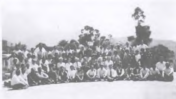
Sabah WMC in Mission Retreat Centre