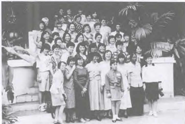
Group picture taken in front of the beautiful Pandanusa Island Resort.