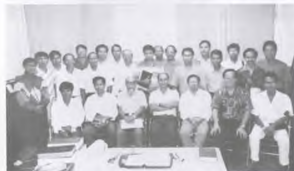
Stewardship Leadership Training Workshop in Sarawak

Two training workshops were conducted for about 25 selected stewardship leaders in Sarawak on March 21-23 and April 27, and one in Sabah for 8 leaders on Sept. 26-28. Topics covered for these training workshops were Christian Stewardship, Gospel Finance, God's Remnant Church With a World Mission and Last Days Message, SDA Church Tithe and Offerings Plan, Mission Financial Self-Sufficiency, Local Church Strategic Planning and Financial Budgeting, and Family Money Management. The participants received thorough instructions on these areas of stewardship emphasis. They will later assist the Mission stewardship directors or even conduct