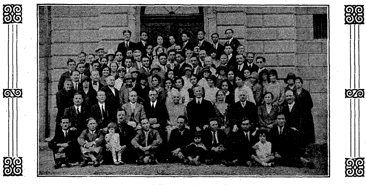
Italian Annual Meeting