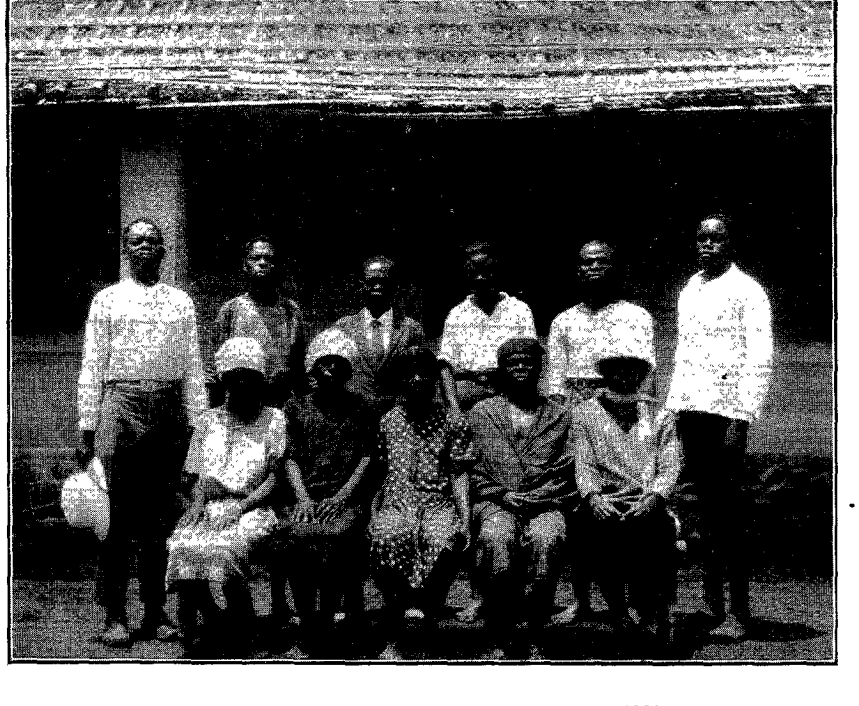
Natives Baptized at Nanga-Eboko, March 15, 1930

On our return to Nanga-Eboko we spent two more weeks in counsel with our missionaries there, and in laying plans for the future extension of the work. On the last Sabbath of our stay our hearts were made happy by the baptism of eleven natives. A careful examination showed these candidates had been well instructed, and were fully prepared for complete fellowship with the people whom God is preparing for the second advent. May this service be but the forerunner of many others in which hundreds, nay thousands, of the dark-skinned sons of Equatorial Africa may be baptized and join the ranks of the church of Him who died to save men of all races and colors.