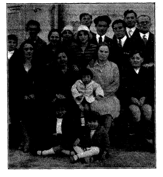
Newly organized Church at Messina

In the year 1908 Messina was visited by one of the most disastrous earthquakes ever recorded. In but a very few minutes 84,000 persons perished; and in Reggio the dead and wounded numbered 50,000. Why did God choose to punish thus this