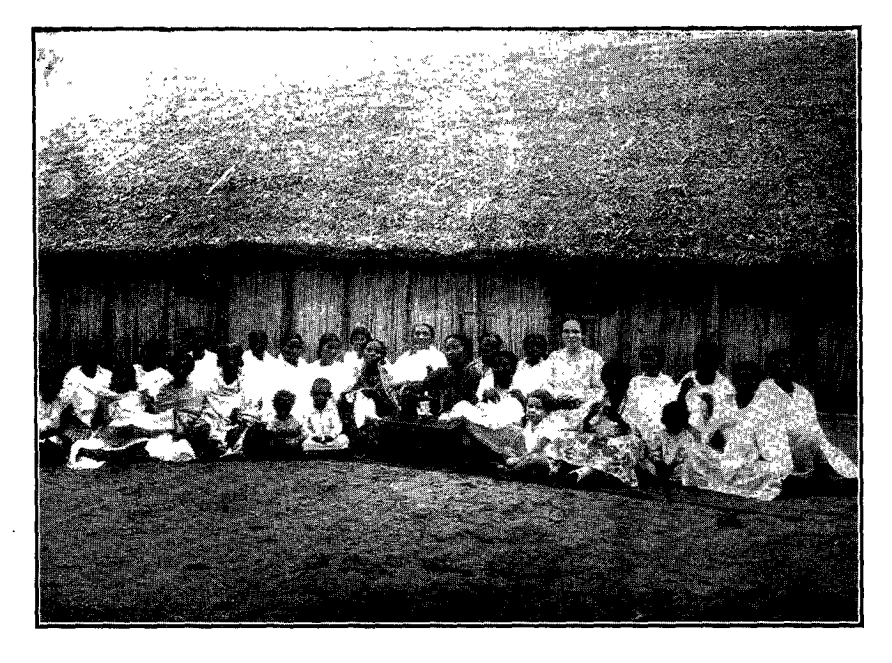
Dorcas Society, Tamatave

giving glory to God, for it is only by Him and for Him that we should work.