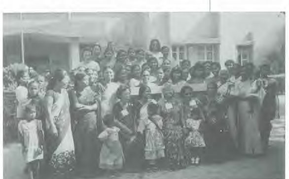
Pastoral wives of the East India Section

went under the trees and wrote out their secret petitions, then burned them all in a glass bowl. The pastoral wives felt overjoyed and truly blessed to be together and share. They left determined to do a mighty work for God in each of their churches.