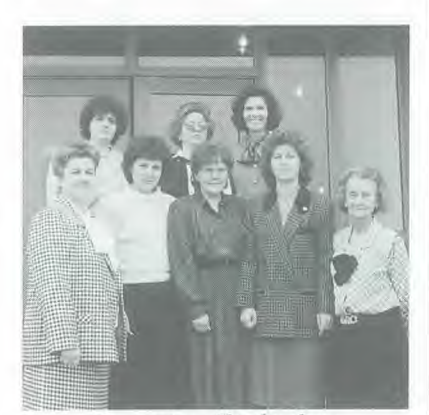
Romanian Shepherdess coordinators

Special meetings were held for retired pastors and their spouses March 19-22 in Monte Real, Portugal. Seeing again old friends from the Lord's work is always pleasant for