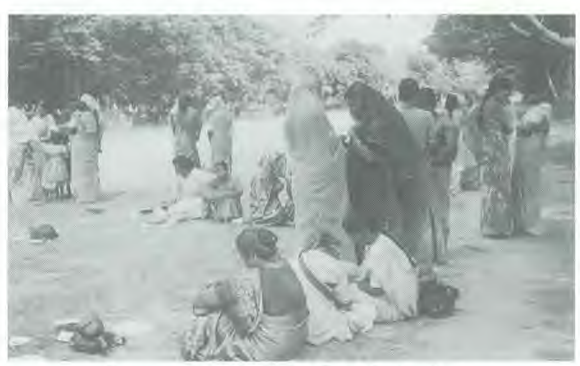
Pastoral wives of the East India Section sharing with each other

nar entitled "How to be the Best for God." There were devotionals. special songs, exercise sessions, and prayer and sharing time. The highlight of a special prayer time was when the ladies