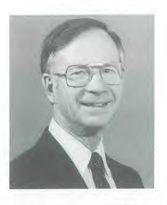
This article appeared in The Adventist Review, May 22, 1986. Used with permission.

Tears welled up as she exclaimed, "No one has ever done that for me before."