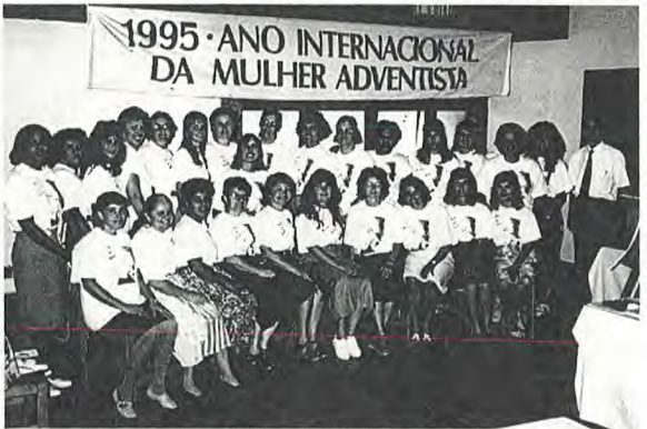
The Matto Grosso Mission Shepherdess Chapter of the Central Brazil Union meet together to celebrate the Year of the Adventist Woman