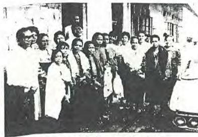
Converts with the pastors' wives