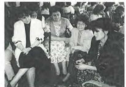
Czech Union pastors' wives in discussion groups.