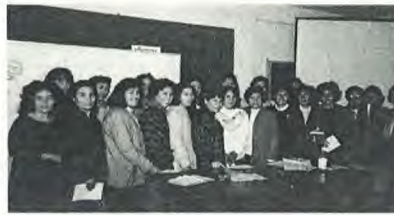
Pastors' wives from the Central Peru Conference at their retreat.