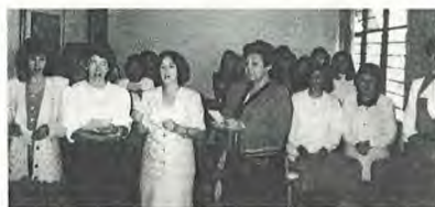
North Ecuador Mission pastors' wives join in song as they begin their Shepherdess meeting.