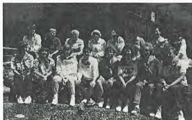
German Swiss Conference ministers' wives in Bernese Oberland

✿ A cheerful group of ministers' wives from the German Swiss Conference met together for three days in June in the beautiful mountains of Bernese Oberland. The presentations, discussions, songs, and prayers centered on the subject of "peace." Interruptions with gymnastics, theoretically and practically, made it easy to concentrate. On one evening the women had the special experience of coloring silk-scarfs. They all were thrilled by the beautiful results.