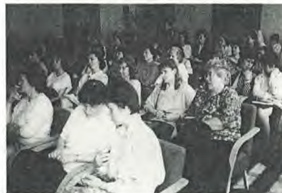
Czech Union pastors' wives listen to their seminars.