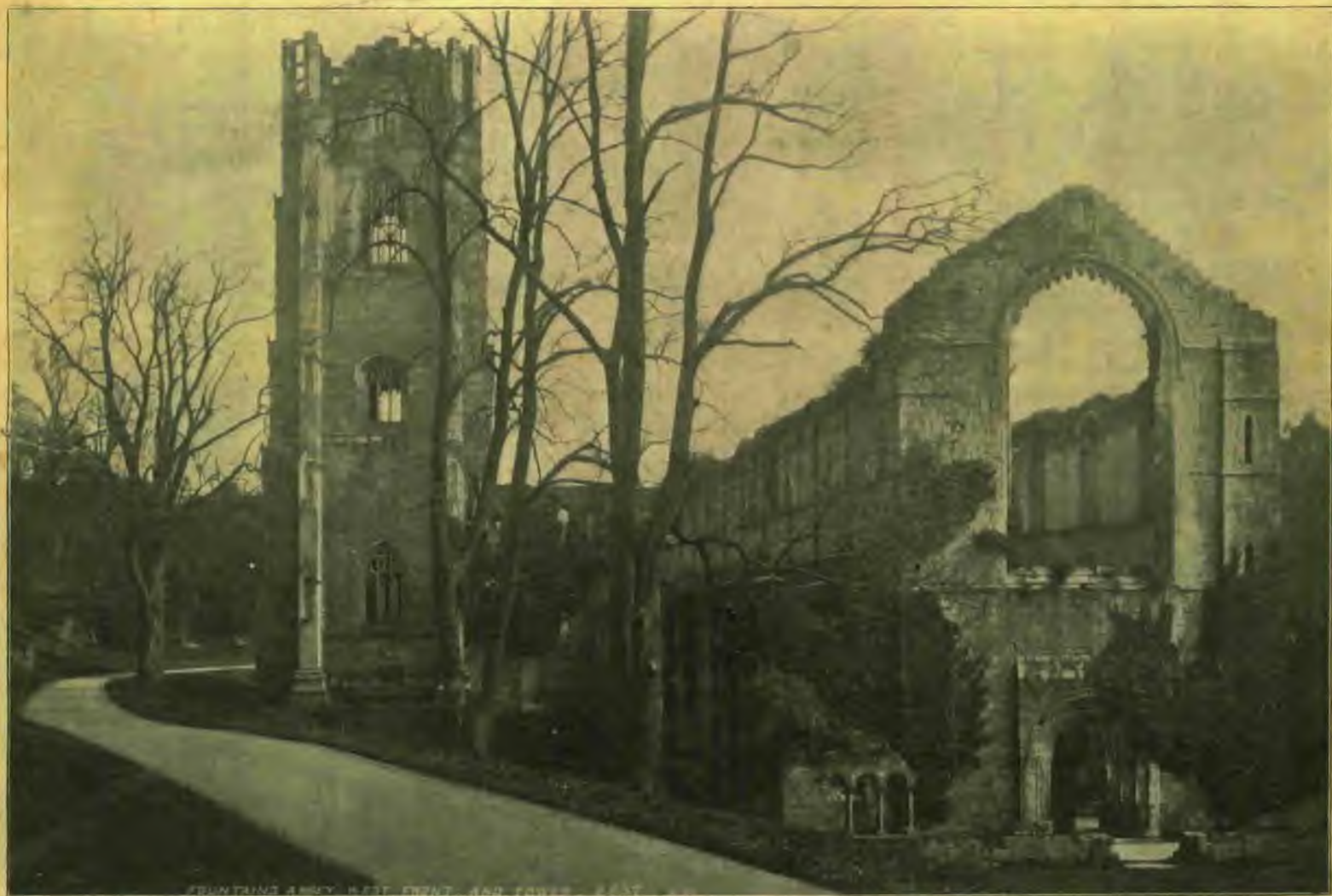
FOUNTAIN'S ABBEY, WEST FRONT AND TOWER EAST

BUT the great building made by hands, showing forth the glory of man, is now in ruins. Nave and transept, choir and chapel,