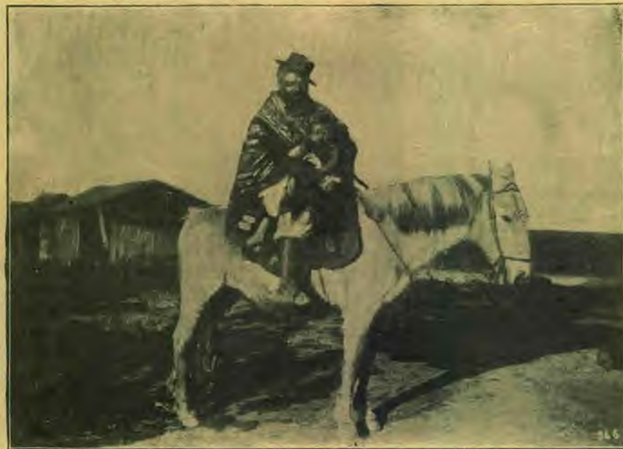
Scene among the South American Indians.