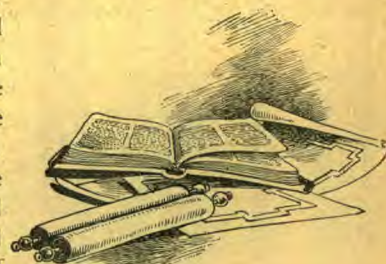
Their Own Plans and Specifications.

Let him who aspires to any place of permanent usefulness or leadership, look well to the regulation of this member, whether it be in the matter of verbal or written utterance. Moreover, let no one delude himself by clamoring for freedom of speech who is known to riot in the license of hasty and inflammatory utterance. —Selected.