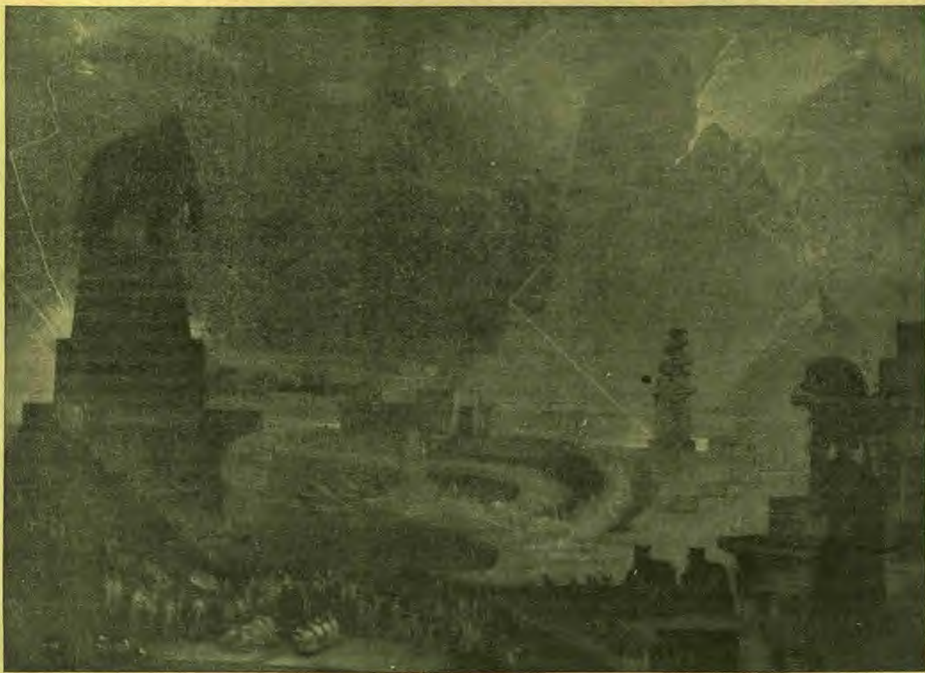
The Fall of Babel.