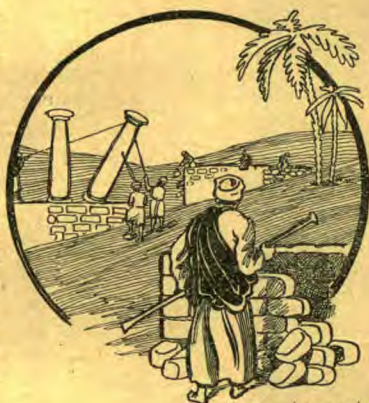
Then began the builders, to tear down the walls