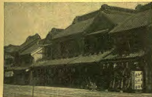
Street Scene in Tokio, Japan.

GRIM-VISAGED war is stalking at large in the Orient. Without a formal declaration of war, but after waiting forty-eight hours from the time of severing diplomatic relations, the Japanese fleet attacked the Russian fleet and fortress at Port Arthur. The attack began at night, and as the Russian ships steamed out to accept the challenge, the Japanese torpedo-boats slipped in between the Russian ships and the shore, and delivered their deadly missiles. Exact details of the engagement are lacking, as the censorship by both powers engaged is exceptionally strict. Absolutely no information is obtainable from Japanese official sources; but the result of this engagement, and at least two others which followed it at Port Arthur and Chemulpo, Korea, is that twelve Russian ships have been sunk or disabled and eight have been captured. The whereabouts of Russia's Vladivostock squadron is not known, tho it is reported that three vessels of this squadron were sunk by Japanese torpedoes, in Tsugaro Straits. A number