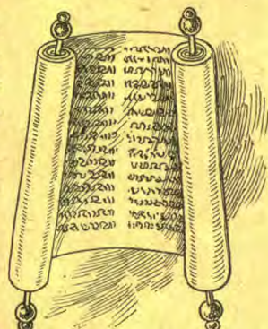
The Book of Plans and Specifications.