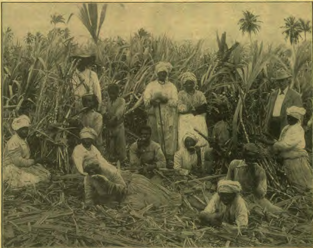
Cane-cutters of Jamaica.