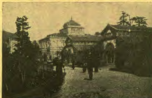
Museum in Ueno Park, Tokio, Japan.

The attitude of the other nations is about as follows: All the principal nations of the world, including China, have now declared their neutrality. France, however, has openly notified the world that she is still Russia's ally, and will see that Russia's