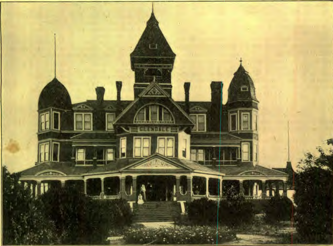
The Glendale Sanitarium.

sanitarium, and the Glendale and Tropic Electric line carries passengers from the Arcade depot in Los Angeles to the sanitarium door. So, while the institution is located in the country, it has convenient access to the city and all parts of the outside world.