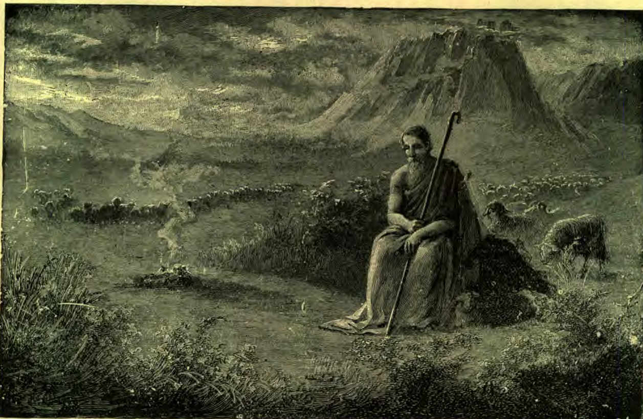
Engraved expressly for "Patriarchs and Prophets."

YET notwithstanding his purpose, he was not yet where God could use him. With faith in his mission, Moses had not yet learned his own insufficiency. He was a warrior by training. Why could not the numerous and hardy Hebrews be mobilized and led against Egypt? His heart burned to redress the wrongs of his people. So when he saw an Egyptian smiting a Hebrew, he promptly killed him, buried the body in the sand, and passed on. The next day he found two fighting Hebrews, and endeavoring to pacify them, the oppressor referred to his slaying the Egyptian the day before, and spurned his interference and leadership. Moses turns away disappointed, for "he supposed that his brethren understood that God by his hand was giving them deliverance." Ex. 2:11-14; Acts 7:25-27. Ungrateful and unappreciative doubt-