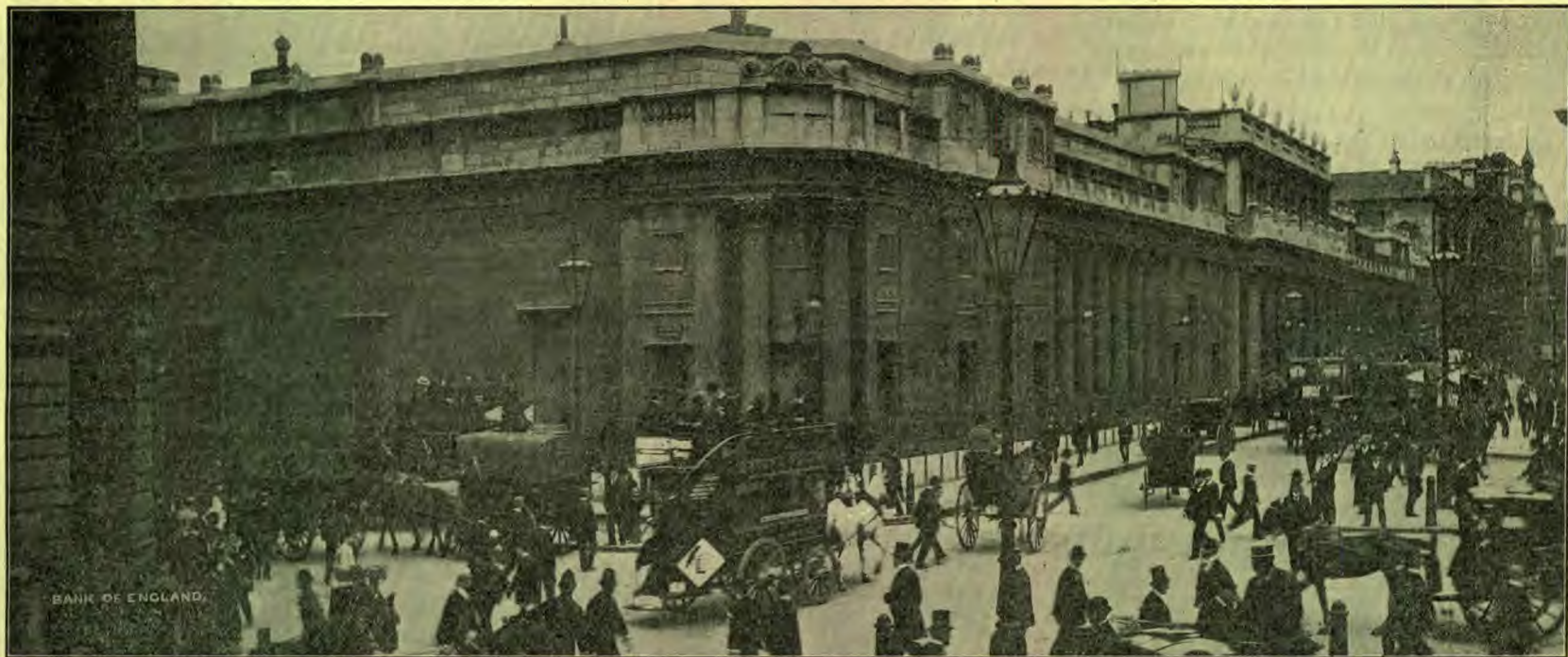
The Bank of England in London, sometimes called the "Old Lady of Threadneedle Street," the strongest financial institution in the world.

THE Bank of Heaven is a beneficent institution. It is not designed to enable the moneyed kings of God's universe or of this earth to lord it over their fellows nor to corner the natural wealth of the world. The Bank of Heaven does not deal with men's wants so much as it does their needs. The