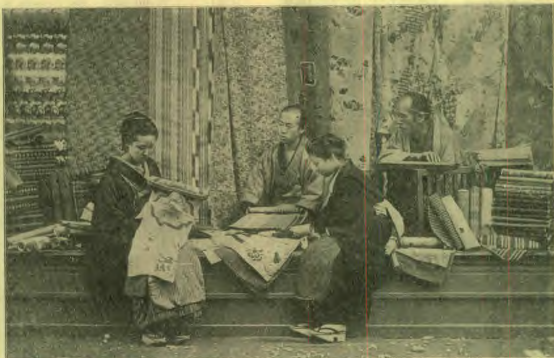
Interior of a Japanese Shop.

yet this artistic, playful vein in their character lies very near the surface, which fact doubtless accounts for its having been discovered by foreigners earlier than their sterner traits. The cares of life seem to rest lightly upon them, and their highly developed artistic sense responds to all the beauties of nature. It is difficult for foreigners to appreciate their keen enjoyment of these. A Japanese will walk miles to see