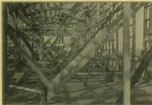
Interior of Press Building, Nov. 14, 1906, looking eastward; diagonal strips are temporary braces.

The great religio-civil question of the day is the Sabbath question. It meets the legislators of every land and state. They must meet it. They may laugh it down, may bury it in committees, may kill it with amendments; but it will face them the next session—this demand for a legally enforced day of worship. Legislators, who understand the principles of government and liberty, know that such legislation is wrong; know it in their very souls, and yet they fear to face a religious element who are clamoring for it. If they oppose such legislation, they fear defeat at the polls when they again come before the people; and so many weakly yield manhood, principle, justice, to the religio-political clamor, which never ought to have a place in American government or politics. Any religious institution whatsoever, that demands legislative support may be set down at once as not of God and the Bible.