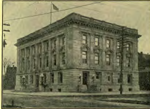
Post-Office and Court House, in Elmira, N. Y.

Sad, sad, unutterably sad indeed, that men can not see the real spirit that is back of all such work and words as these I have faithfully chronicled. Well may the Angel of the Apocalypse, flying in the midst of heaven, give forth the clarion cry to the world: "Wo, wo, wo, to the inhabitants of the earth."