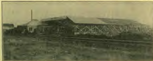
Press Building, Nov. 14, 1906, looking southeast from across railway track. The building is much further along now. Progress on interior work can not, of course, be shown. The cement floor is well started, and the roof nearly covered.

Therefore, the question of the Sabbath is all-important to every soul. The great distinctive mark of the true God, the one attribute which the Bible ever sets before us, in contrasting Him with false gods, is His creative power. "All the gods of the nations are idols; but the Lord made the heavens." Ps. 96:5. See Jer. 10:10, 12; Acts 14:15; 17:24-26; Isaiah 40; Rev. 14:6, 7. The good tidings which God sends the world is that the power of God manifest in creation is the power which is manifest in