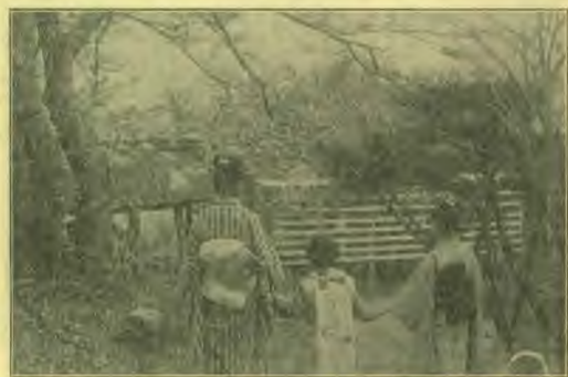
Viewing the Cherry Blossoms.

essary. Not so, it would seem, in the case of a squad of railway section hands, all raising their picks at the same time and letting them fall together. It has been pointed out that this mechanical method of labor necessarily detracts from the excellence that results from more individual effort. But of course this method of working can only be applied to certain forms of unskilled labor.