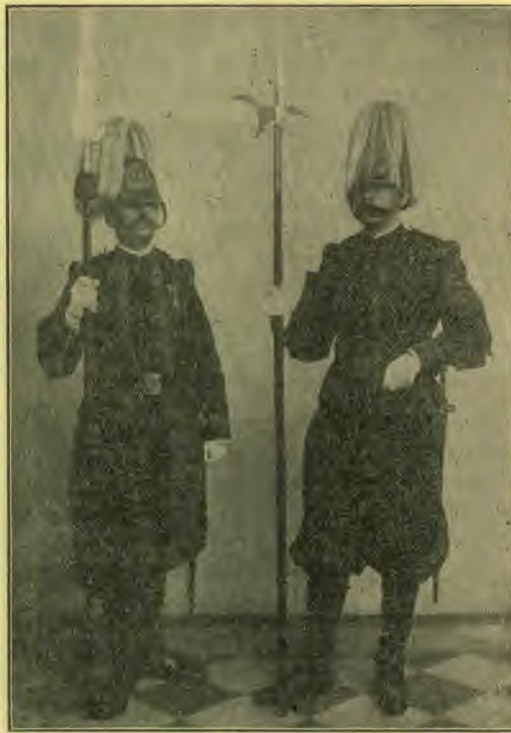
Two of the Famous Swiss Guards of the Vatican.

President Roosevelt, in an article in the Century Magazine for October, 1900, expressed the following sentiment: "In this country we are long past the stage of regarding it as any part of the state's duty to enforce a particular religious dogma." It is to be hoped that he will remember and honor this utterance when the time comes, as it surely will, when he will be called upon to affix his seal to any Sunday-enforcement law. For compulsory Sunday observance in any degree is the enforcement of a religious dogma. Nothing but religion ever made Sunday in any way distinctive from other days, and but for the alleged religious character of the day we would not hear any clamor for its enforced observance on any pretext whatever. The physical rest argument, the sanitary claim, and