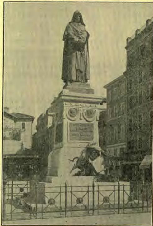
Statue of Fillippo Giordano Bruno, an Italian philosopher, born 1548, died at the stake Feb. 17, 1600, because he was a dissenter from the Roman Catholic faith. From the time he was arrested by the Inquisition, in 1593, to his death, he was subjected to persecution and imprisonment. Under papal protest this monument was erected in 1889, on the spot where he met his death. The very spirit which put Bruno to death is in the Sunday-law régime.

Then the convention adjourned to meet one year hence in the city of Oswego. Thus came and went