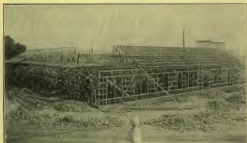
Press Building, Nov. 8, 1906, looking northeast, from boarding-house balcony.

Our Thanksgiving number sold well in this valley. A few of our earnest workers went out from this church and found a ready sale. Two young ladies sold each twenty-five copies in about three-fourths of an hour in Redwood City. One young man in part of a forenoon sold fifty copies in Mountain View.