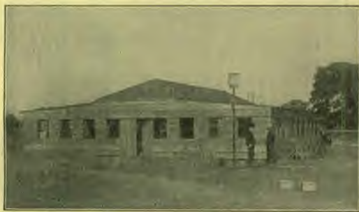
The Home of the "Signs of the Times."