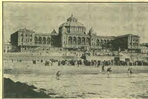
Palace Hotel, Headquarters of French, Austrian, and German Delegates.

Indeed, since the first conference, two facts had occurred which might well shake the confidence in such councils and blast the hopes which they had at first awakened; first, England, who in July, 1899, had appeared before the world as the champion of arbitration, had, in October of the same year, begun a