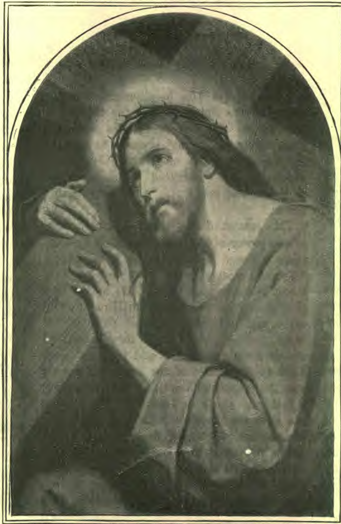
WHAT OUR GIFTS COST.

"This is that which was spoken by the prophet Joel." "This Jesus hath God raised up, whereof we all are witnesses. Therefore being by the right hand of God exalted, and having received of the Father the promise of the Holy Ghost, He hath shed forth this, which ye now see and hear." Acts 2:32, 33.