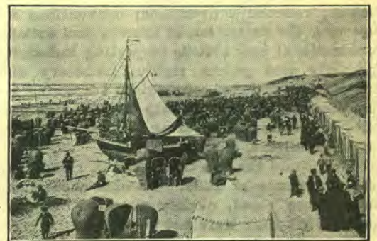
Fastime on the Beach at Scheveningen.

Here something must have happened. A tremendous pressure seems to have been brought to bear upon the great powers by "pacifist" influences. Baron d'Estournelles de Constant was seen taking a fast train to Paris.