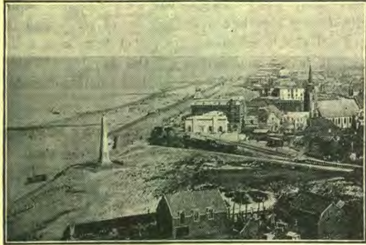
General View of Scheveningen Beach with the Various Grand Hotels Where Many of the Delegates Live.

July 7, the "Peace Conference Messenger" (at The Hague) said: "There are three com-