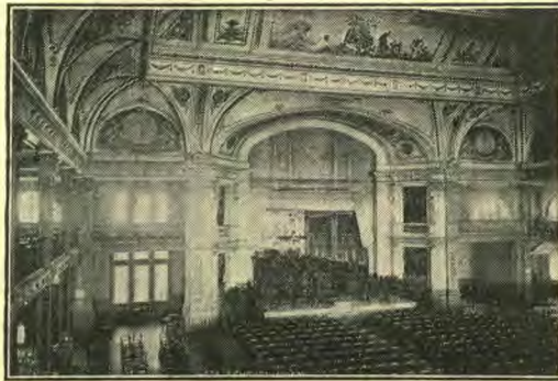
Concert Hall Where Delegates Hold Evening Meetings.

The negative attitude and labors of the conference caused a profound disappointment to those who were watching it with anxiety and were expecting from it the end of the terrible nightmare of general war. The "Independence Belge" received from one of its correspondents the following lines of sad irony: