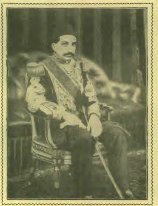
The Sultan of Turkey.

But while prolonged and disastrous wars are held in check until this sealing work is