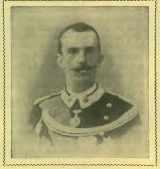
King Victor Immanuel III of Italy.

other prophecies of a like nature, indicate commotions and strifes among the people. The wording of this prophecy itself will show that to any mind who thinks of it closely. This holding of the strifes and warfares of earth comes at a time when God has commissioned His messengers to set His seal upon all His servants in all the earth. There is something special indicated in this sealing. It is not the ordinary work of converting peo-