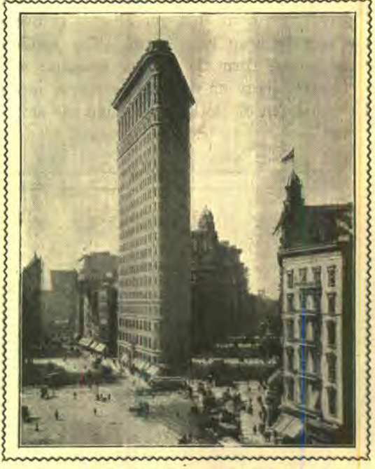
"Flat-Iron" Building, New York, Only About Half as High as the Life Insurance Building in Course of Construction.

Northern Texas has been suffering because of heavy rain-storms that prevailed there for several days prior to April 19. On that date the worst of the storm seemed to be over. The loss is estimated at more than $1,000,000. The Texas and Pacific Transcontinental Railway was cut in two by the floods, and trains were not able to pass to or from California for nearly a week. At Waco the Brazos River reached a depth of thirty-five feet, and the eastern portion of the town was inundated by the breaking of a levee. Farms in the lowlands are greatly damaged, and hundreds of head of live-