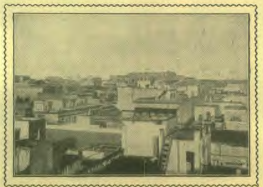
Panorama of San Juan, Porto Rico.

When the island was discovered, it was very poor, according to history, the Indians only raising enough of such articles as yams, maize, yucca, etc., to appease their hunger. But this was not the fault of the soil, but the lack of cultivation; for that it was not poor in natural wealth is proved by the fact that a little scratching here and there caused it to produce sufficient with the addition of the fish that they caught, to support 150,000 of the Indian inhabitants (some