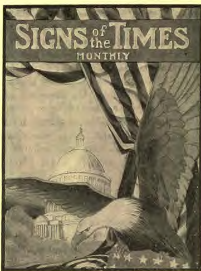
A striking cover design in red, white, and blue

The world saw the bright flame of LIBERTY leap from the white-hot crucibles of time and experience, and the dull, leaden skies of dark and medieval days were lightened with the glory of the flame. Valley Forge, Bunker Hill, and Yorktown, the minutemen at Lexington, the pouring out of the virgin continent's best blood and richest treasure, were the price paid to secure the recognition of the principle that "ALL MEN ARE CREATED EQUAL." But was the price any too great? "Life, liberty, and the pursuit of happiness" was both the goal and the victory.— The Altar Fires of Liberty.