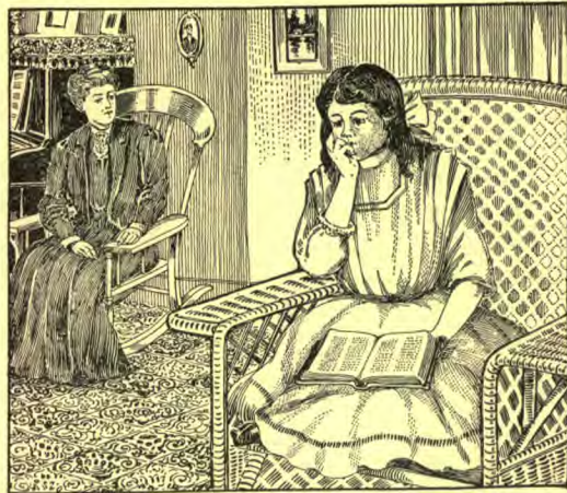
From " How Esther Read Her Bible "

Eight well-filled pages. Price 50 cents a hundred, post-paid.