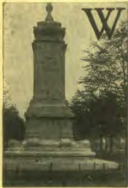
TYNDALE'S MONUMENT AT VILVORDE, BELGIUM

His Promise for the Boy at the Plow—His Life-Work Sheds Its Blessings on Us Still—His Martyrdom