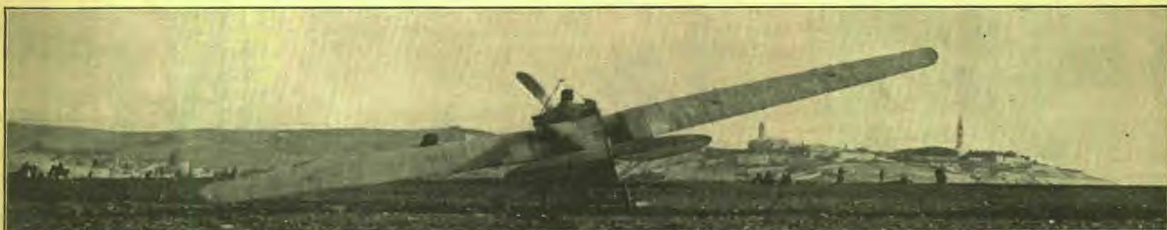
FIRST AEROPLANE IN JERUSALEM

PACIFIC PRESS PUBLISHING ASSOCIATION MOUNTAIN VIEW, CALIFORNIA