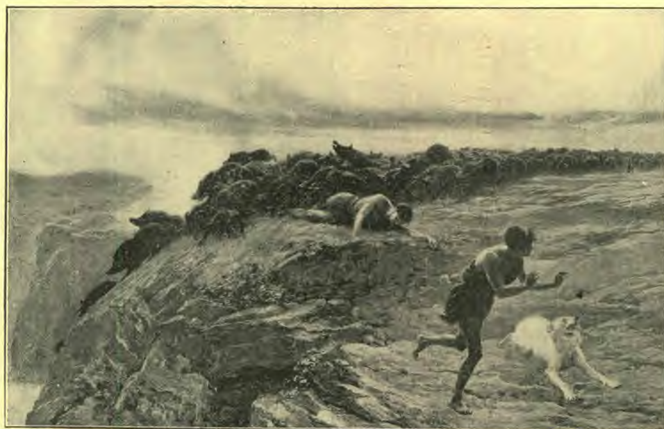
"Meanwhile the demons, cast out from their human habitation, have entered into the swine, and driven them to destruction."

But as soon as He points out their duty, they are ready to obey. Not only did they tell their own households and neighbors about Jesus, but they went throughout Decapolis, everywhere de-