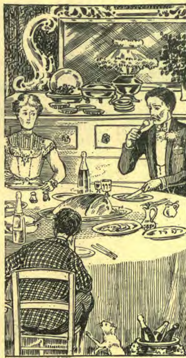
"An overfed stomach, struggling with a lot of refuse and poison"