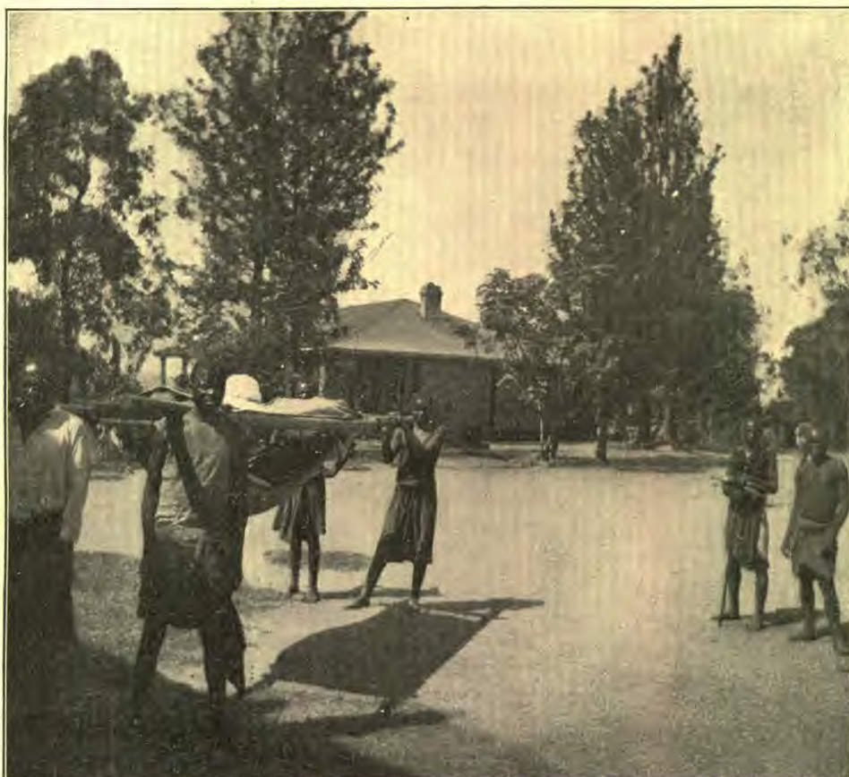
An African reclining machila,—a tiresome, expensive means of travel, but the only one where no road exists.

THE opportunity is offered to help some one not so fortunate as ourselves. Many calls—in fact, a continual stream—are received at the office, for copies of the SIGNS for those who can not afford