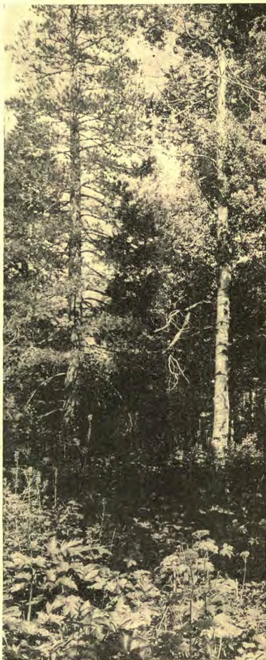
"OUR EARTH IS TO BE RESTORED TO ITS EDEN BEAUTY."

We now turn our attention to the time and manner of the fulfilment of these promises. When and how will they be carried into effect? It is certain that they will not be fulfilled until after the close of probation. We showed, in a previous article, that all who will be saved are to receive their reward at the same