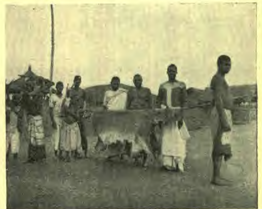
Fresh lion skin for sale. This old lion killed two persons before it was captured by the crude methods of these natives.