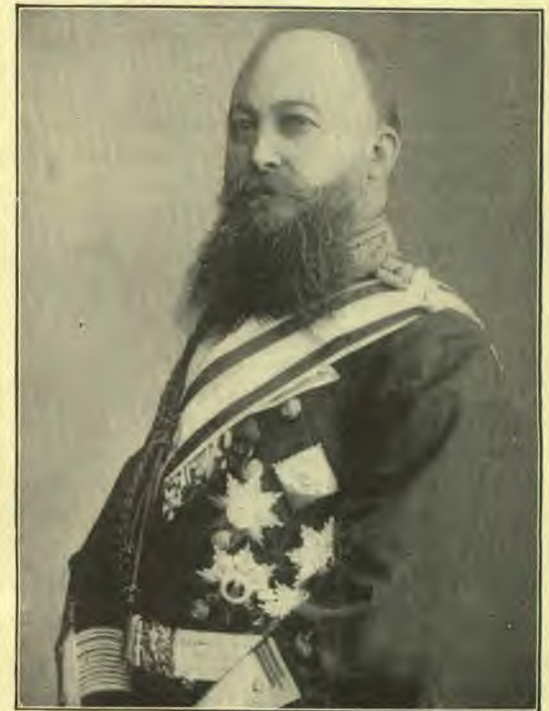
High Admiral Alfred P. T. von Tirpitz, commander of the kaiser's naval forces

From this peace agitation, Emperor Nicholas II, of Russia, in 1898 was encouraged to