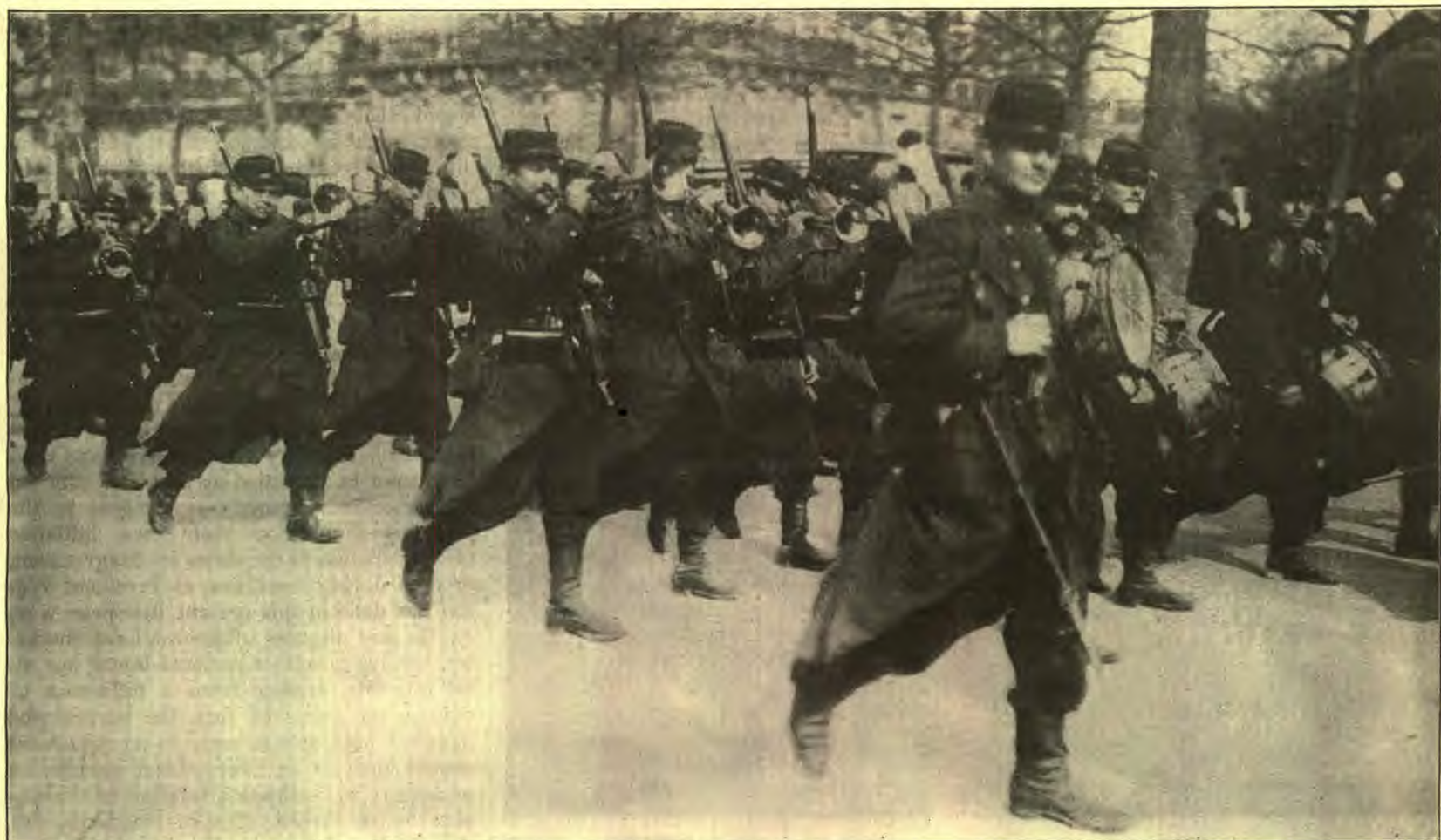
French troops — one of the army corps that were ordered to the front