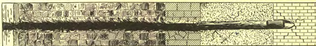
Actual penetration of a trial shot from a 16 1/4 inch gun. The missile passed through 20 inches compound plate, 8 inches wrought iron, 20 feet oak timbers, 5 feet granite, 11 feet concrete, and 6 feet brick.— Heralds of the Morning.

A live book upon the great social, political, economic, and physical problems of the day, scripturally explained. Over 100,000 copies sold. 384 pages; nearly 200 illustrations, many full-page. Cloth, $2.00; half leather, $3.50. 10 per cent higher in Canada. Order through our depositories (see list on page 15), or Pacific Press Publishing Association, Mountain View, California.