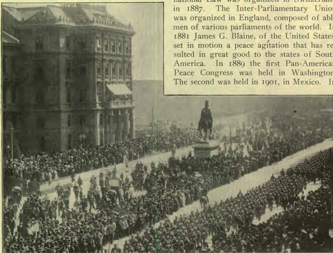
War scene in Vienna, the capital of Austria. This is typical of the intense excitement prevailing.

invite the nations of Europe to the Hague. Twenty-six responded to this, and the first Hague conference was held in 1899. It was hoped that this conference would bring about such a condition that international differences could be adjusted without war where the parties are honestly agreed. The second Hague peace convention was held in 1907. If we remember correctly, there were forty-four nations signatory to that convention. According to the actions of that convention, the signatory powers (1) would use their best efforts to insure the pacific settlement of international difficulties; (2) if diplomacy failed, they were, as far as circumstances would allow, to resort to the mediation of one or more friendly powers; (3) it would not be regarded as an unfriendly act if one or more powers—strangers to the dispute—should on their own initiative offer mediation to the states in disagreement, or even during hostilities, as President Wilson has done in this present European war; (4) in any disputes of international character, involving neither national honor nor vital interests, arising from a difference of opinion on points of fact, the parties who have not been able to come to an agreement should institute an international commission of inquiry to facilitate a solution of the dispute by an investigation of the facts; (5) they agreed that arbitration is recognized as the most effective and at the same time the