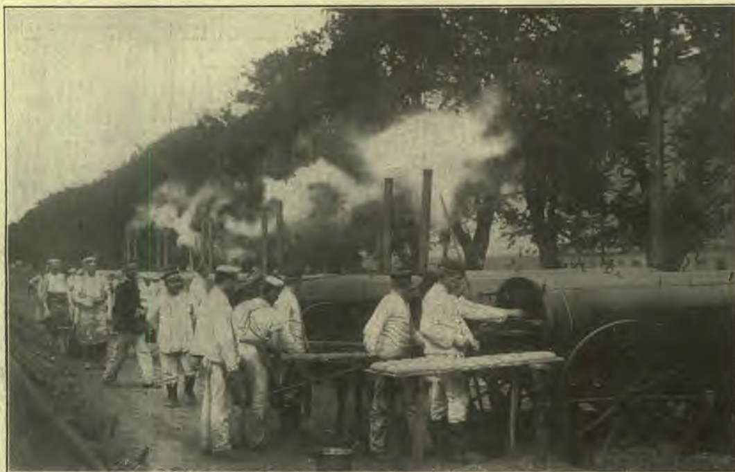
Portable bake-ovens of the German commissary department. This battery of ovens furnishes 16,000 loaves of bread daily for one division of the army.

Your cooperation is wanted. Everybody is intensely interested, many are deeply concerned, over the clash of arms in Europe. War bulletins and newspapers are eagerly read. They are all right so far as they go, but they do not satisfy. People wish to know the significance of this and similar disturbances that come upon the world so suddenly nowadays. The Bible tells, and it is clearly pointed out in the columns of the "Signs of the Times," as you know. The widest publicity possible should be given to this fact. May we not count on you to cut out the blank on page 14, present the matter to your friends and others, and secure subscriptions from them for three or six months? A little help from each one will increase this journal's power for good, and your efforts in its behalf will be greatly appreciated.