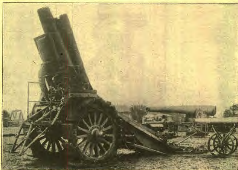
KRUPP SIEGE MORTAR

The promise of Christ's coming was the "blessed hope" in the patriarchal age. In Job's dark hour of trial, his heart clung to the promise, and he was kept from despair. "For I know that my Redeemer liveth, and that He shall stand at the latter day upon the earth: . . . whom I shall see for myself, and mine eyes shall behold, and not another." Job 19: 25, 27.