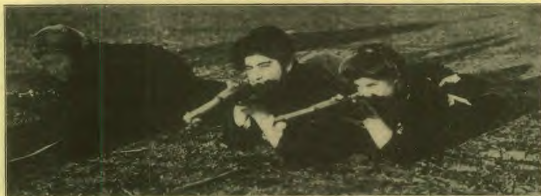
THE FAMOUS LEAGUE OF DEATH, SOLDIER WOMEN OF SERVIA

What is the dragon? We are told in Rev. 12:9 that the dragon is the devil. In Rev. 20:2 he is called again the devil and Satan.