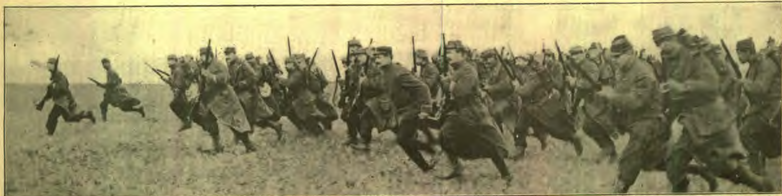
FRENCH INFANTRY ADVANCING ON THE DOUBLE QUICK

The settlement of the Balkan question must include the settlement of the Turkish or Eastern question. "The Balkan or near Eastern question has been one of the most complicated political problems of the world's history for half a century. . . . For four centuries and a half, ever since the conquering Turk crossed the Bosphorus and took Constantinople, the grim contest has been to dislodge him by war and diplomacy." — American Review of Reviews , November, 1912, pages 539, 540.