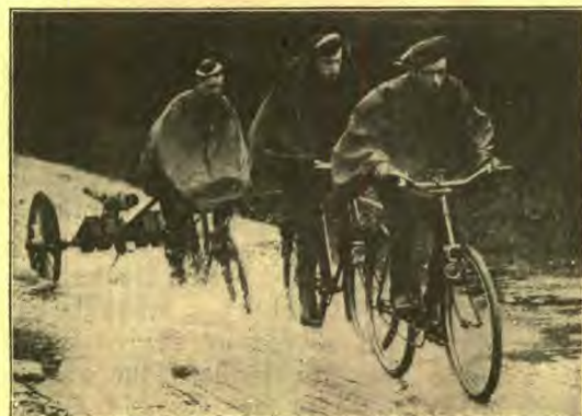
BRITISH BICYCLE CORPS, WITH ITS COLT GUN, FORDING A STREAM