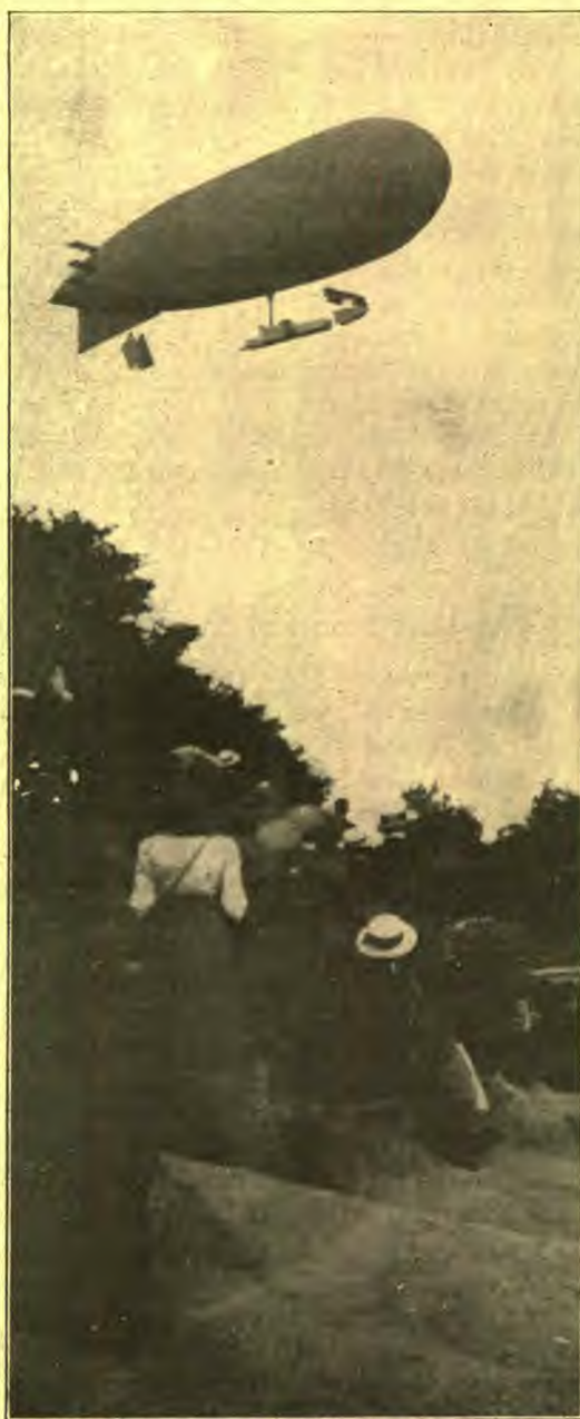
FRENCH DIRIGIBLE PATROLLING THE FORTIFICATIONS OF PARIS

Therefore we find in Palestine a nation that will not mix with the other nations. Its thought, its policy, its work, its religion, are such that it can not mix or be mixed with the others. Consequently when the great world confederacy is to be formed, the people occupying this territory must be conquered. Had God's people remained true to Him,