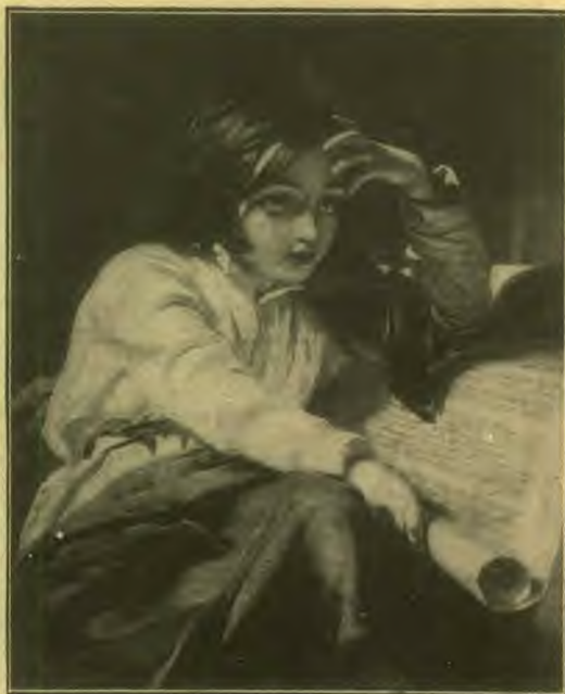
"From a child thou hast known the Holy Scriptures."

IN closing His memorable Sermon on the Mount, Christ gives the impressive story of the house built upon the rock and the house built upon the sand. The former withstood the severe storm in which the latter became a heap of ruins.