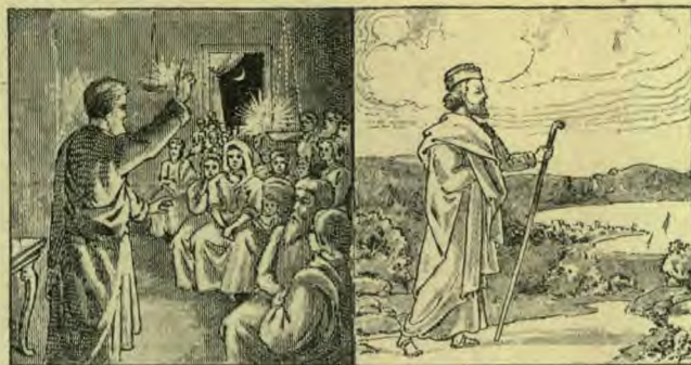
"There is no doubt that this passage contains the record of a religious meeting on the first day of the week."

THE eighth instance of the mention of the first day of the week, in the New Testament, is in the book of 1 Corinthians: "Now concerning the collection for the saints, as I have given order to the churches of Galatia, even so do ye. Upon the first day of the week let every one of you lay by him in store, as God hath prospered him, that there be no gatherings when I come. And when I come, whomsoever ye shall approve by your letters, them