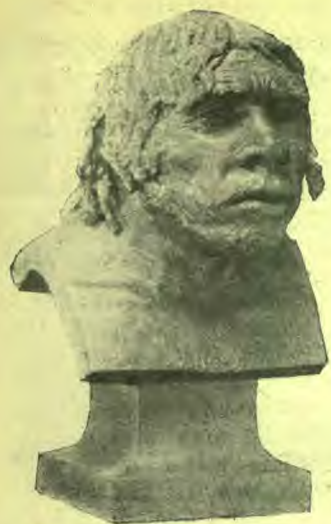
The Neanderthal man, a race that is supposed to have lived in caves of central France many thousands(?) of years ago.