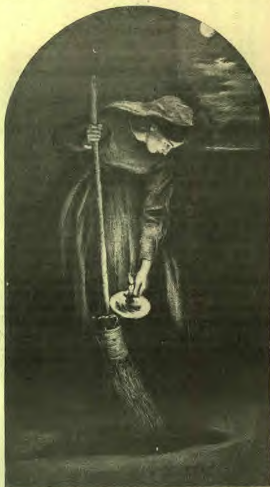
"He has preached sermons on . . . the lost piece of money."

On the occasion when Nicodemus came to Christ, the Lord told him the two alternatives: "For God so loved the world, that He