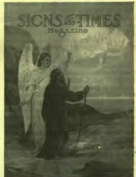
Miniature likeness of the August cover, which is beautifully printed in three colors.

Over 100,000 others have, and many are talking about it, too. One who has been a subscriber to the Signs Magazine from the first, said: "Seems to me it is getting better all the time. The August number is just fine." She was impressed with the article entitled "World Conditions as Seen by Others." It is full of startling facts that will produce serious reflections.