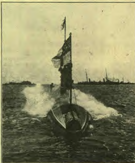
A SUBMARINE RISING TO THE SURFACE. WITH AIRCRAFT, ONE OF THE MOST MODERN BRANCHES OF NAVAL POWER

SPEAKING concerning the wounded lying on the battle field, where sharpshooters made it impossible to render them help, the same writer says concerning their sufferings: