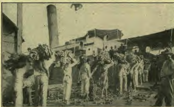
LOADING BANANAS ON THE STEAMER—JAMAICA

"I had heard," she said, "that Seventh-day Adventists did not believe in Christ. One Saturday, going to market, I met Brother —, who said to me, 'Good morning, sister!' I thought, Why does he call me sister? I said to him, 'Why do you call me sister, when you do not believe in Jesus?' 'I do believe in Jesus,' he said. 'Do you?' I asked. 'Yes,' he replied; 'and if you believed in Him as I do, you would not break His Sabbath.' There for a few minutes he told me about the Sabbath and the coming of Jesus. I went on to the market, but I could not buy a thing. I went home, and told my husband: 'I cannot go to market any more on the Sabbath; I must follow Jesus in Sabbath keeping too.' And I do thank God