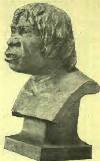
A head reconstructed on the Piltown skull, found in Sussex, England; believed to have lived there 100,000 to 300,000(?) years ago.

WHEN an ex-president of the United States has an inclination to indulge in literary work, he can at once command an audience. And when this same individual has already acquired a considerable reputation as a hunter, a naturalist, a patron of scientific work, almost as himself a scientist, we may be sure that people will listen to his pronouncements on scientific matters with great interest if not with absolute reverence. And such an effect will be increased, if possible, when the writing of such an author, on such a subject, appears in a publication of a technical or a semi-technical character.