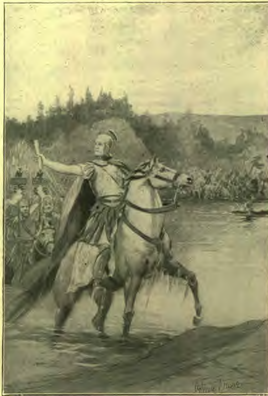
CAESAR CROSSING THE RUBICON

There is a deeply significant thought in the very idea of an "eternal city" and empire. Curious it is that the early memorials of Rome appear to be Greek in their origin. That name, "Rome," was Grecian in its genesis, and literally interpreted, means "Brute Strength." And "Brute Strength" correctly describes the foundation upon which the entire edifice was reared. Brute strength was what their woof and warp was woven from. And brute force is the intrinsic, the ultimate thought which is and ever has been