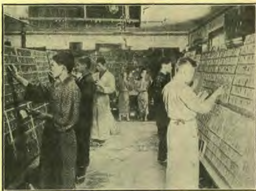
From "Miss Review of World" SETTING TYPE FOR CHINESE BIBLES IN THE FUKUIN PRINTING HOUSE, YOKOHAMA

So those who "sleep in Jesus" cannot be forgotten , from the fact that His sheep hear His voice at that time as well as when they listened to it amid the dead issues of human pil-