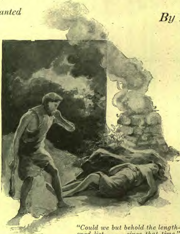
"Could we but behold the lengthened list . . . since that time."

The church possesses many jealous members whose Christian experience is not such