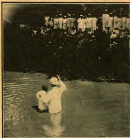
World-wide mission work is the greatest sign of Christ's soon return. He Himself specified this in Matthew 24: 14. The fact that this generation is witnessing the fulfillment of this prediction is proof positive that this age is to see the consummation of the Christian's hope.

At another time, the disciples asked Jesus what would be a sign of His second coming and the end of the world. Among other things, He said, "This gospel of the kingdom shall be preached in all the world for a witness unto all nations; and then shall the end come." Matthew 24: 14. It is rather a blind interpretation of Scripture to say that this