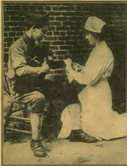
"Frenchie," a canine veteran of the trenches, invalided home. He was born in the American trenches eight months ago. His mother, a message carrier, was killed shortly after his birth. His two brothers were killed at the time he received his wounds. A shell exploded near by, a splinter of which severed his tail, the member whereby he wigwagged his love messages; and one of his forelegs was fractured. He is at Camp McPherson, and is receiving medical attention, as other faithful soldiers are.

Many thinking men are becoming aroused to the fact that the mere theories of Christianity and the formal dogmas of religion are not sufficient. The soul must come to the living word of God, and have a personal contact with the divine power, and have a definite message burning in heart and mind, if he is to attain the standards that are set for the follower of Christ. It is well that we stress more and more the careful study of the Bible, so that we may each know God for ourselves, and be living embodiments of His message of salvation to the world.