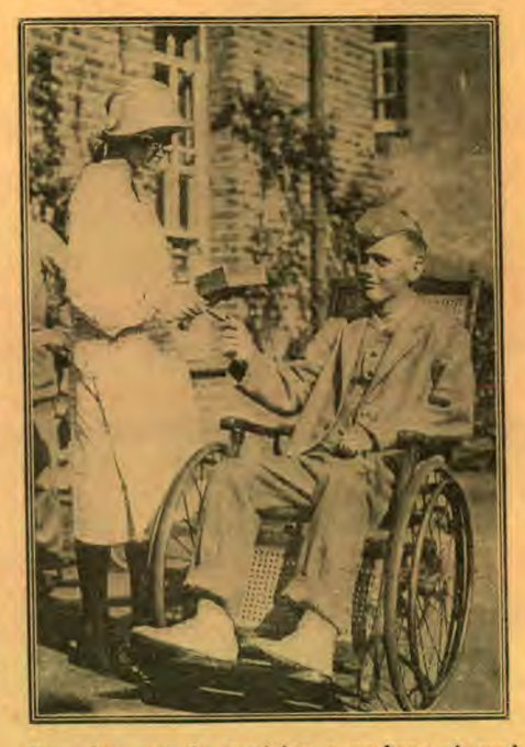
Your boy may be receiving a package of good things through the kindness of the Red Cross. From every part of the land, they are cared for, and even their smallest wants are looked after. The English girl above is giving the wounded American, who is convalescent in a British hospital, a box of food.

A disease similar to tuberculosis has made its appearance in Europe as a result of malnutrition. The world must now give itself to the study of increasing