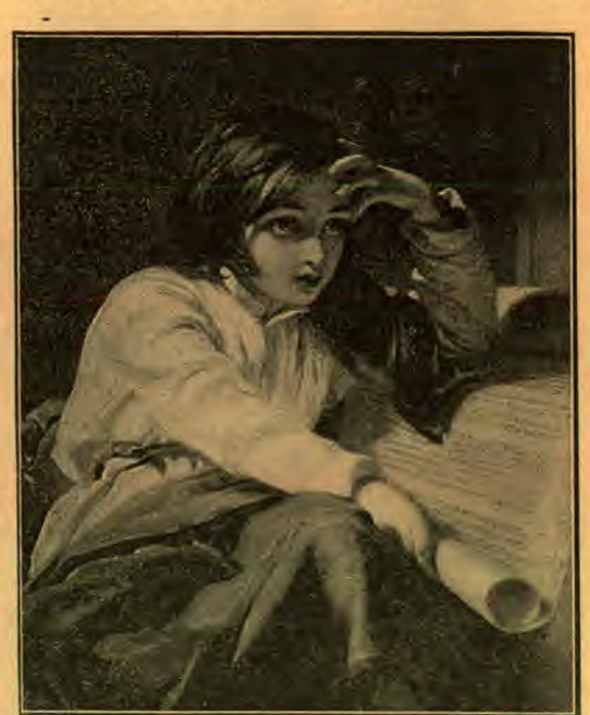
Timothy studied the Scriptures from his earliest years.

The Scriptures, then, are a good thing for women to handle; and even the chil-