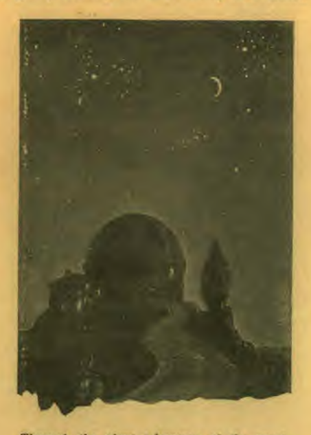
Through the giant telescopes of the great observatories, uncounted millions of suns and systems can be seen.

That other worlds are inhabited is strongly implied in the stated fact that "all the host of them" were created as this one was,—light, air, fruits, etc. Again, Adam, the first man, was called