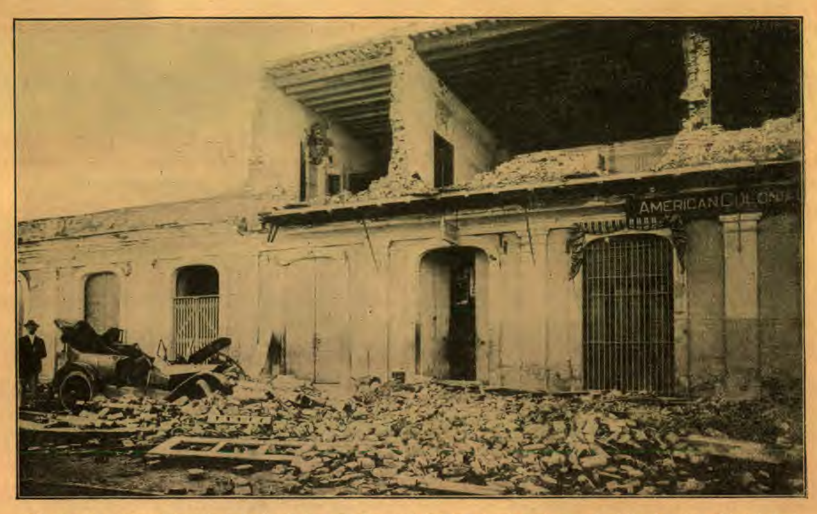
This is not a picture taken along the battle front in France or Belgium, but is a photograph of the American Colonial Bank as it appeared after the earthquake in Porto Rico in October. Devastation that would have been mourned the world over occurred on this island, but remained practically unnoticed because of events in Europe. The photograph is of the town of Mayaguez, which was among the worst sufferers. The automobile on the left was demolished and its lone occupant killed.