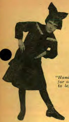
"Hands on hips. Bend as far as possible to right, then to left, then to position."