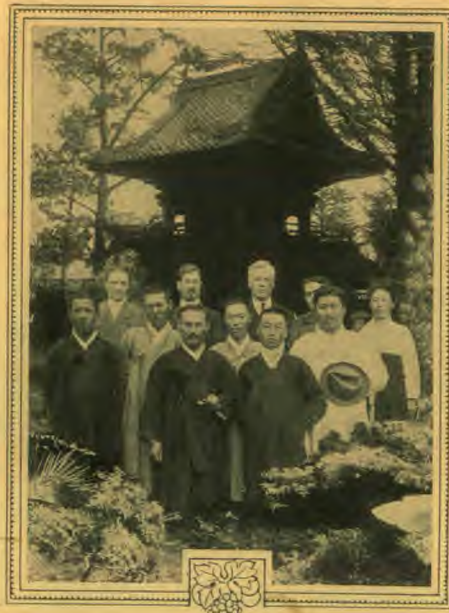
They have sent out hundreds of missionaries into heathen lands. In these lands, they have organized schools and training centers for native assistants. Above is the faculty of the Bible School at Soonan, Korea.

This message is given for this particular time, and to meet the special