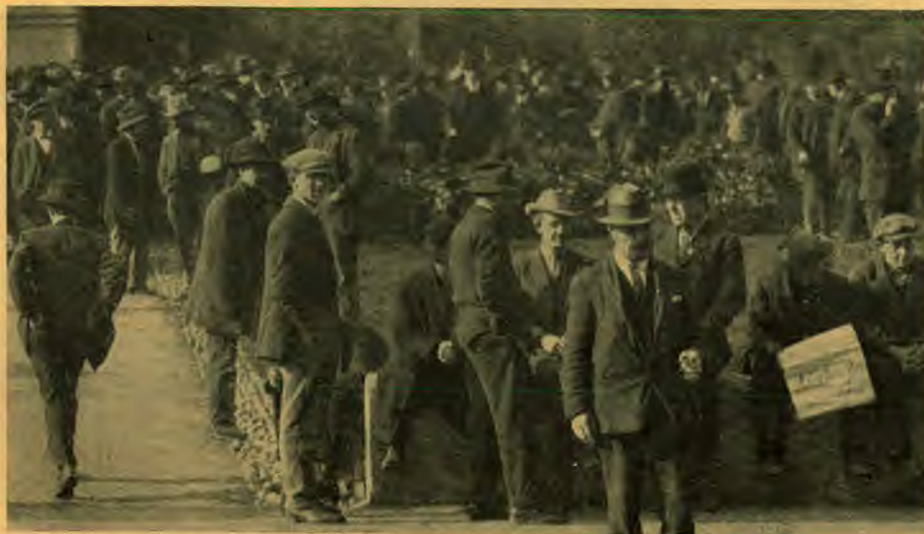
Factory strikes, railroad strikes, textile workers', bricklayers', masons', painters', and plumbers', are among the many pictured and mentioned in the daily papers.

Pick up any daily newspaper and scan the news. Why, capital and labor struggles are so frequent that one is surprised not to read of a strike somewhere. We hear of metropolitan newspapers being tied up because of the newsboy strike. In opposition to government protest and