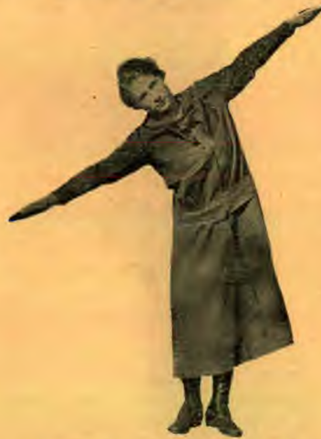
"Arms sidewise stretch, palms down. Twist as far as possible to right, to left, to position. Repeat."

But there are many cases of constipation which are the result of insufficient exercise, of faulty eating, of irregularity, or neglect in the matter of nature's