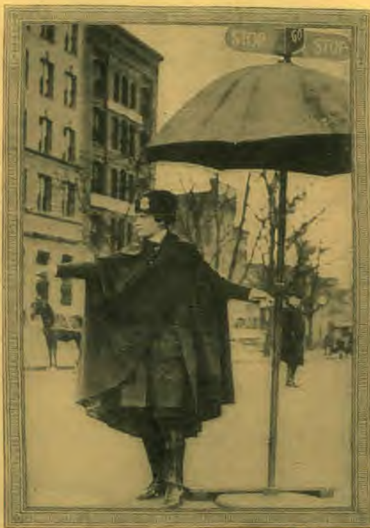
When this first woman traffic officer of the United States says "Stop!" to vehicles of Washington, D. C., they dare not move, for she carries dignity of command that is absolute. When she signals "Go!" they dare not tarry. Jehovah also has traffic signals for those who pursue the narrow way to a life eternal.

young people and children more than fourscore colleges, academies, and similar schools, and more than seven hundred lower schools. In these educational institutions, they are training about thirty thousand children and young people in the principles of the third angel's message, and many of them are definitely preparing themselves for service in the proclamation of that message.