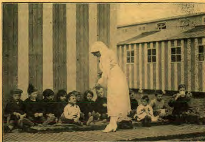
Belgian orphans and other children victims of the war are cared for by the American Red Cross. The Belgian queen has made a particular appeal to the American nation for these little ones who are suffering so much, and through no fault of their own.

"Let not your heart be troubled: believe in God, believe also in Me. In My Father's house are many mansions; if it were not so, I would have told you; for I go to prepare a place for