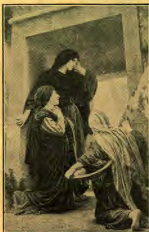
"He is not here, He is risen."

That this movement which stirs the wrath of the dragon is the same as that which gives the warning message against the beast and his image, as recorded in