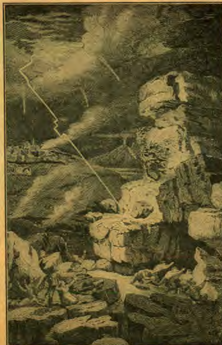
We have reason to believe that these plagues will be literal and terrible catastrophes which will sweep the world.

The opportunity thus afforded to man to settle his own destiny is the greatest of all our privileges. The short span of our individual lives is long enough for us to make this necessary decision; and no offer of grace that gives repentance beyond this life, is held forth in the Scriptures. On the contrary, the Bible teaches that preparation for eternal life must be made before death overtakes us. In speaking of the final resurrection, Christ thus pictures those who will be raised: