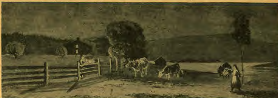
There was the appearance of midnight at noontide.