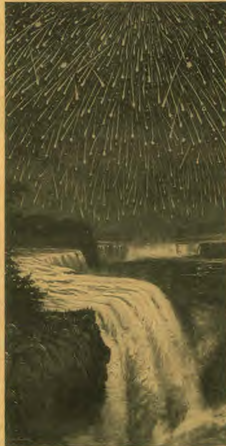
People who saw it, say that it was a superb and magnificent sight.

"Another witness writes: 'The nineteenth of May, 1780, I well remember. I was then in my sixteenth year. My father and mother, who were pious,