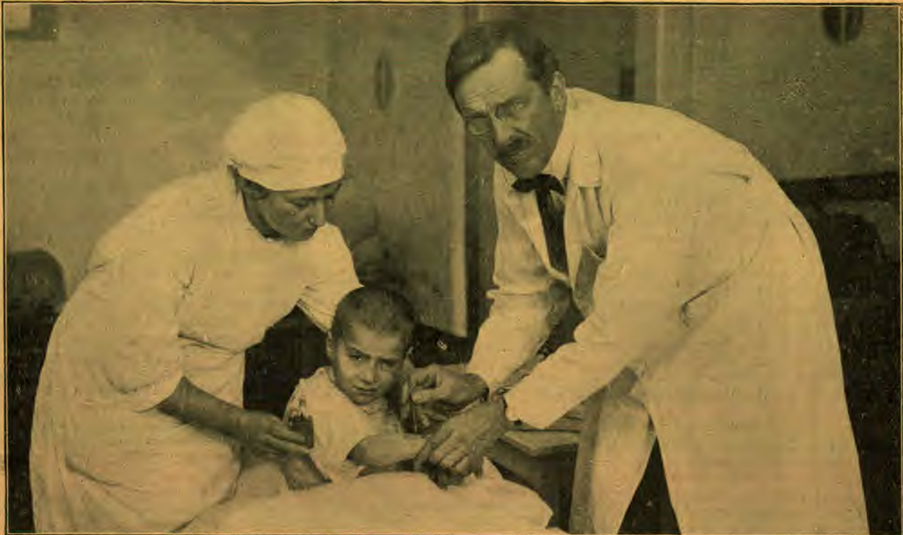
International Malnutrition has resulted in thousands of Austrian children's contracting tuberculosis. Professor Clemons Pirquit, for many years connected with the Johns Hopkins Hospital of Baltimore, is now chief adviser to the Entente Food Commission in Vienna, and is here seen injecting some of his new serum in a tubercular patient. The terrible suffering brought upon innocent childhood through the great war is but one of the many crimes which must be met by its instigators in the final reckoning before a just and merciful God.