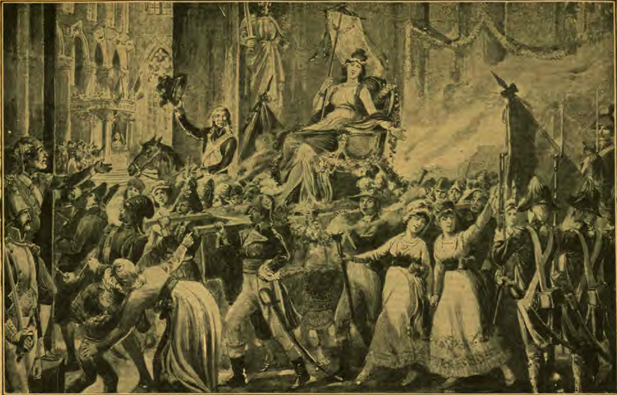
The experiment has been made. Terrible were the scenes enacted in France when atheism became the controlling power. It was then demonstrated to the world that to throw off the restraints which God has imposed is to accept the rule of the cruellest of tyrants. Above is the celebration of the enthroning of the goddess of reason.