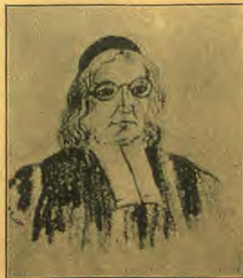
This is a photograph of a pencil drawing made by a spirit claiming to be Signor Ricci, of himself. It was made in about five seconds. This happened at a séance in South Africa.

As says Sir Arthur Conan Doyle, in the London spiritualist Weekly Light : "We should now be at the close of the stage of investigation and beginning the period of religious construction. For what is this movement? Are we to satisfy ourselves by observing phenomena with no attention to what the phenomena mean, as a group of savages might stare at a wireless installation with no appreciation of the messages coming through it, or are we to resolutely set ourselves to define these subtle and elusive utterances from beyond, and to construct from them a religious scheme which shall be founded upon human experience on this side and upon spirit inspiration on the other? These phenomena have passed through the stage of being a parlor game; they are now emerging from that of being a debatable scientific novelty; and they are or should be taking shape as the foundations of a definite system of religious thought, in some ways conformatory of ancient systems, in some ways entirely new." Or as Sir Arthur Conan Doyle says again, "Further proof is superfluous, and the weight of disproof lies upon those who deny."