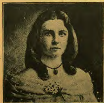
This is a spirit painting made in 1908 at Chesterfield, Indiana. The spirit took about twenty minutes for the work; and when completed, it was recognized and identified as a portrait of a young woman, a member of a prominent family, who had lately died.