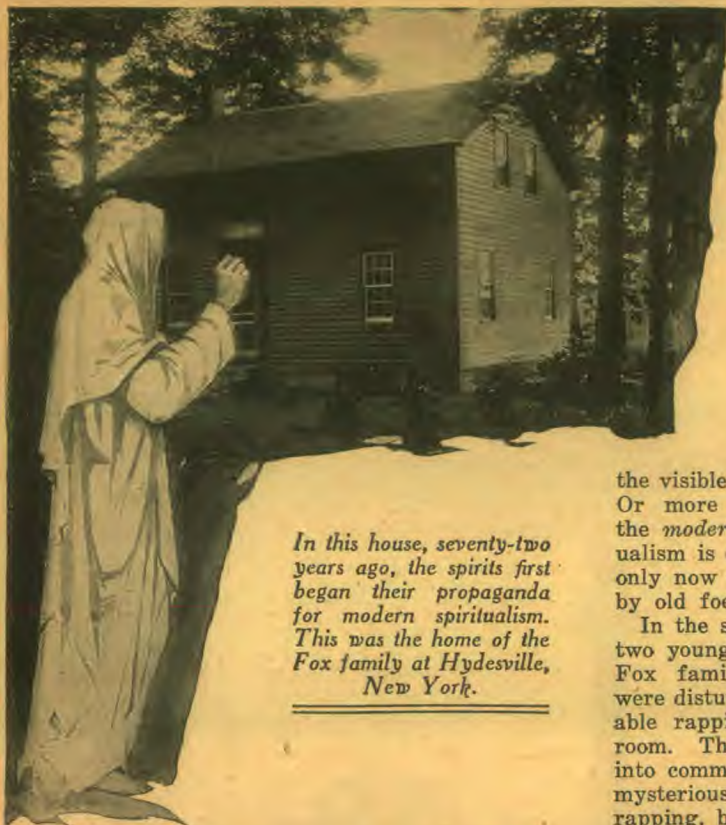
In this house, seventy-two years ago, the spirits first began their propaganda for modern spiritualism. This was the home of the Fox family at Hydesville, New York.