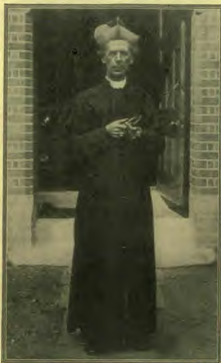
Archbishop Mannix, of Melbourne, Australia, who has recently visited America, and who, on his way to Ireland, was taken from a steamer by a British destroyer and was prevented from going to Ireland. For many years, he has been a bitter foe of England; and he never speaks but that he champions the Irish cause and vilifies English rule in Ireland.

Then we may not depend upon "signs" and "wonders" in establishing our belief; but we must come directly to the