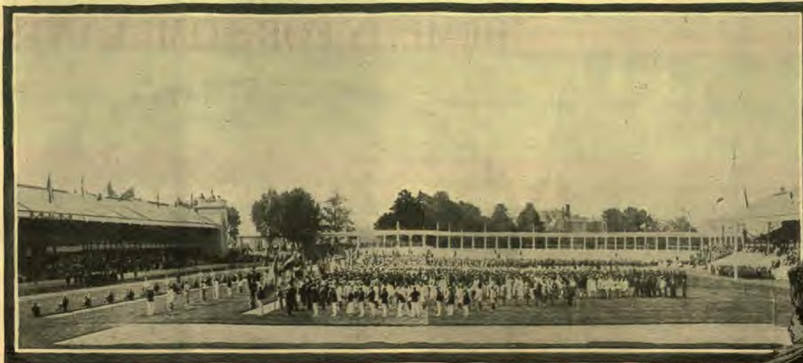
A general view of the athletic stadium at Antwerp, Belgium, on the opening day of the Olympic games, in which the United States athletes easily gained first place.