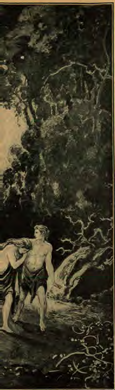
forfeited all right to their Eden home.

attending sorrows. But in His infinite wisdom, He was looking ahead to His completed plan for the universe. Through all eternity He longed to have creatures who would love Him and honor Him, and this could be possible only as they were given intelligence, reason, and the gift of free will.