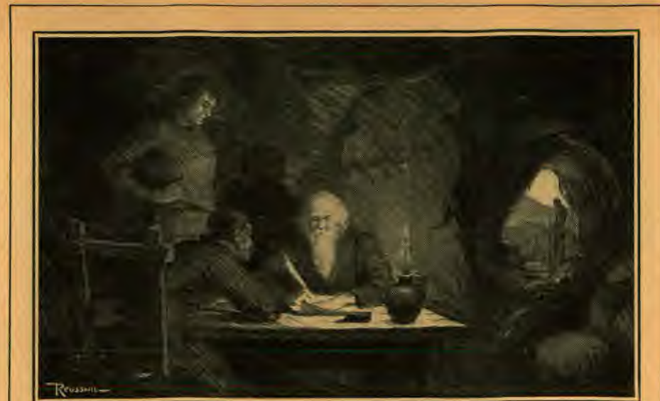
During the Dark Ages the light of the gospel shone only in the caves of the wilderness and in the dens of the mountains.

In the divine explanation given of this striking symbol it is made plain (Daniel 8:23-25) that this "little horn" represents "a king of fierce countenance, and understanding dark sentences;" that "his power shall be mighty," but it will not be his own power, but power imparted from a hidden source; that "he shall destroy wonderfully," especially "the mighty and the holy people;" that policy, craft, self-exaltation, and deadly trickery will be outstanding characteristics; and