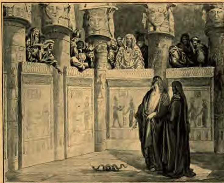
Moses, though an example of meekness, had courage to stand undaunted before Pharaoh.