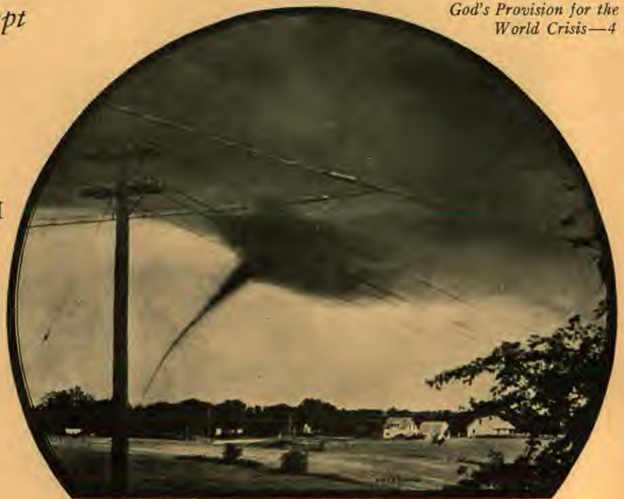
A greater storm than any the world has ever known is in the offing; the only refuge in that day will be the one that God Himself provides.