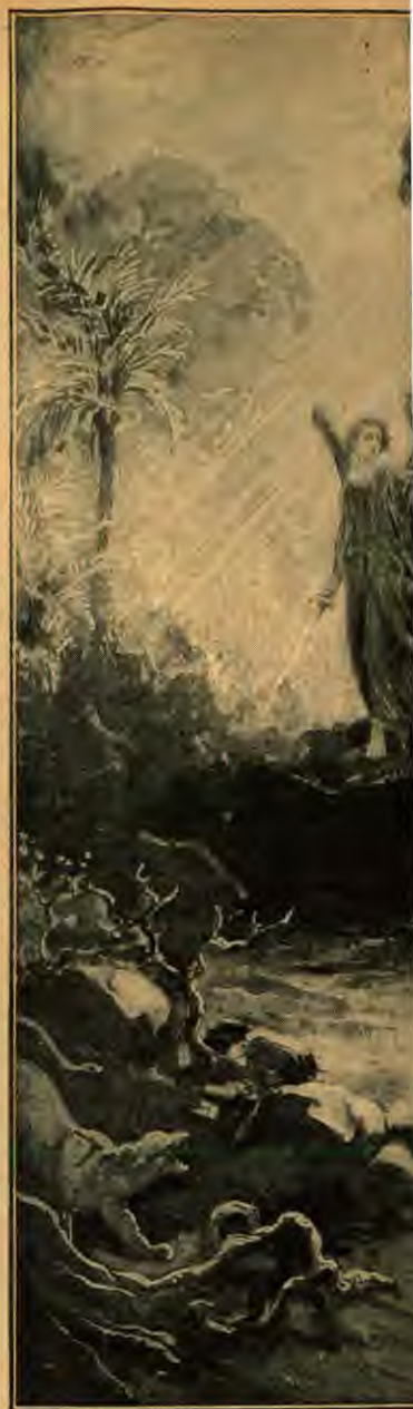
By choosing to disobey God, Adam a

Why was it necessary for God to permit sin? If men were to exist in this life only, perhaps it would have been wise for the Father to create human beings like mechanical toys, for then they would have been preserved from evil and its