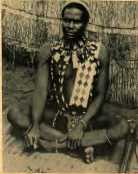
Lying before this African witch doctor are the bones which are commonly thrown by these men in practicing divination.

In 1927, a doctor, a close personal friend of mine, left the glowing possibilities of a lucrative medical practice in California to devote his life to the needs of humanity